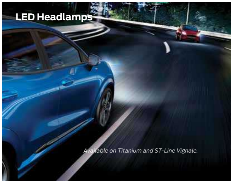
Available on Titanium and ST-Line Vignale.