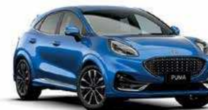
Desert Island Blue*