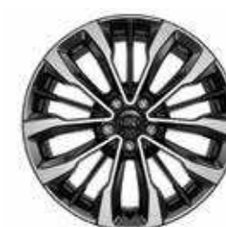
ST-Line Vignale – 18” 10-spoke Absolute Black machined Alloy wheel