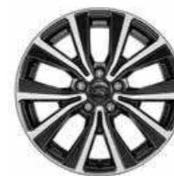
Titanium – 17” 10-spoke Black machined finish Alloy wheel

*Please note metallic paint is a chargeable option.