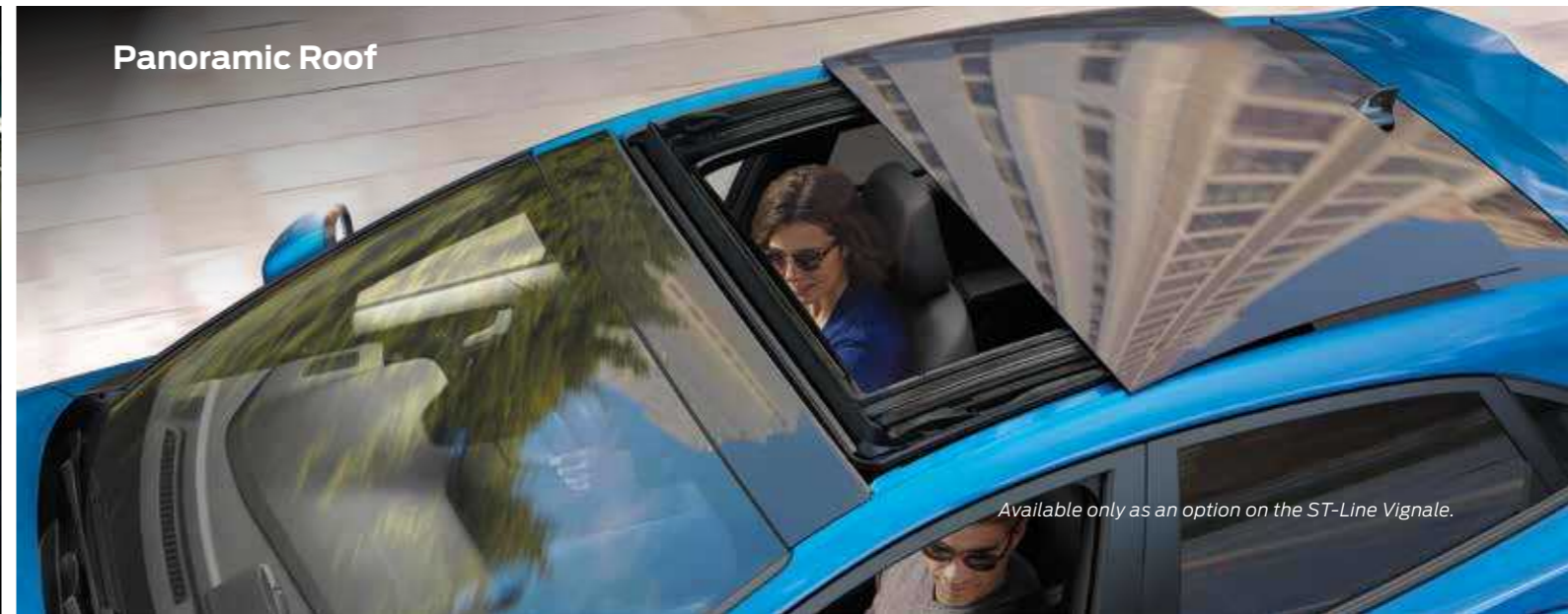
Available only as an option on the ST-Line Vignale.