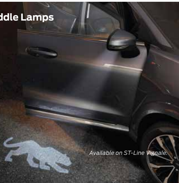
Available on ST-Line Vignale.