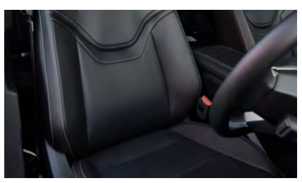
Heated Front Seats