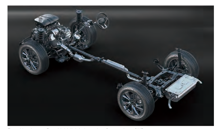
Front Macpherson Rear Multi-link Independant Suspension + 2WD