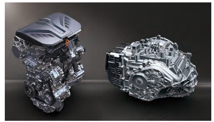
1.5 Turbo Petrol Hybrid

Power is delivered through the state-of-the-art Direct Hybrid Transmission (DHT), that guarantees you experience impressive acceleration, power at lower speeds, and improved fuel economy at higher speeds.