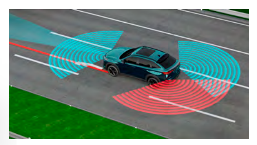
LKA (Lane Keep Assist)