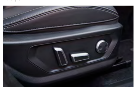
6-Way Electric Adjustable Driver's Seat