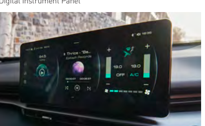
12.3 inch Full-colour Touch Screen