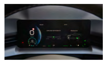
Digital Instrument Panel

Experience complete control and convenience when navigating with the 10.25 Inch Colour Combination Instrument, 12.3" Colour Multi-Touch Screen, and pioneering Head-Up Display.