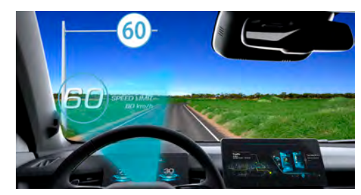
TSR (Traffic Sign Recognition) Overseas model shown.