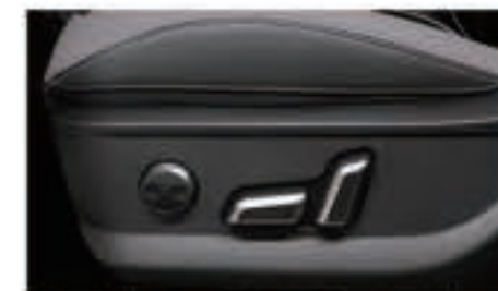
Driver 6 Way Power Adjustable Seat with 2 Way Power Adjustable Lumbar Support