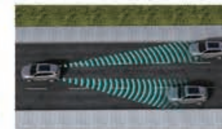
Lane Change Assist