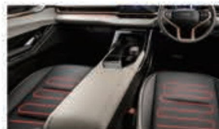
Front Seat Heating