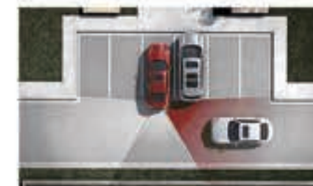
Rear Cross Traffic Alert