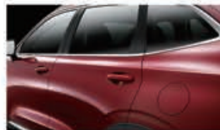
Classic Body Waist Line