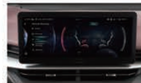
12.3-inch Ultra-smart Touch Screen