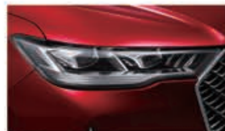
Rising Flame LED Headlamp