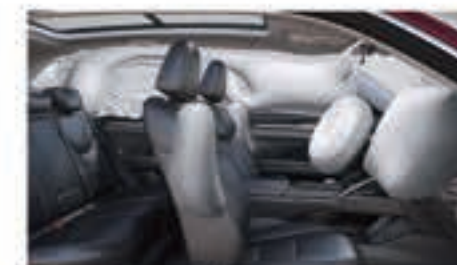
6 Omni-directional Airbags