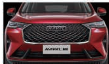
A fusion design of Asian and European influences

Inspired by a fusion design of Asian and European influences, every design detail has been fine-tuned and crafted with a purpose and sense of sophisticated elegance.