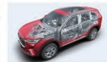
71.61% High-strength Steel Body