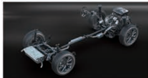
Front Macpherson rear multi-link independent suspension + AWD