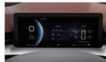
10.25-inch Virtual Instrument