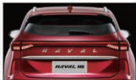
Horizon Rear LED Taillight