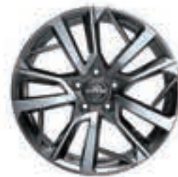
18-inch astrolabe wheel hub