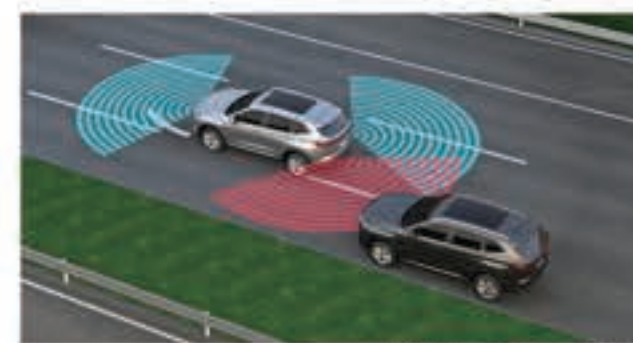
LKA (Lane-Keeping Assist)