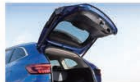
Auto Lift Tailgate