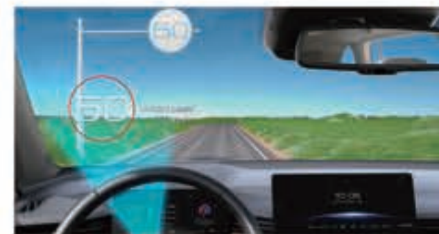
TSR (Traffic Sign Recognition)