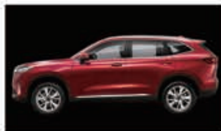
Vivid Body Proportion