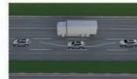
Smart Collision Avoidance