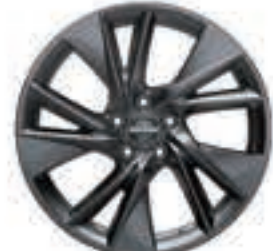
19-inch vortex wheel hub

*Black interior will be standard for all models, all other interior colours are optional and will have a 3-4 month waiting period.