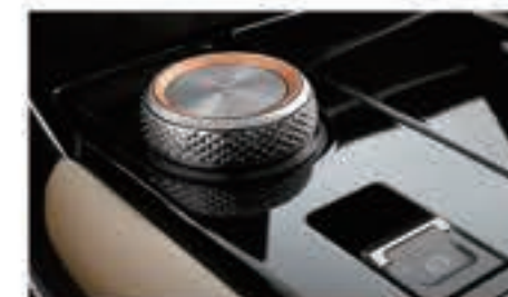
High Gloss Electroplating Rotary Shift