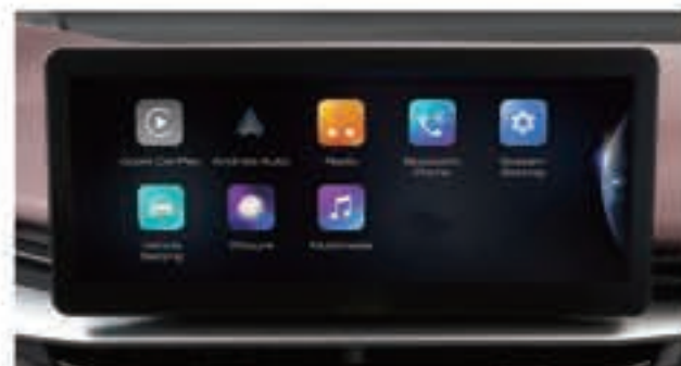
Carplay & Android auto

At the heart of the Haval H6 is a tech-savvy infotainment system that turns any task into a small tap on a screen. No matter where the journey takes you, stay connected to the outside world with a convenient wireless smartphone charger, CarPlay and Android Auto.