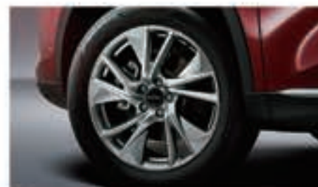
19-inch Vortex Wheel Hub