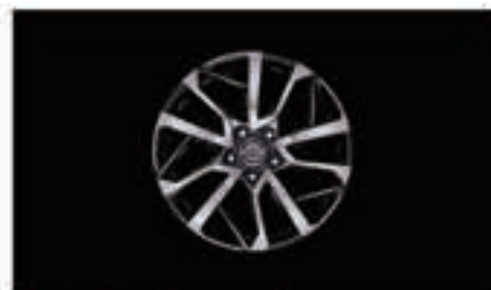
18-inch Astrolabe Wheel Hub