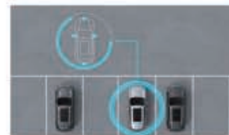
360° AVM (Around View Monitor System)

The Haval H6 boasts an intelligent suite of safety features, so you can spend more time enjoying the journey. Cruise with confidence on any journey with Autonomous Emergency Braking, Adaptive Cruise Control, Lane-Keep Assist and Rear Cross-Traffic Alert.