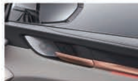
10 Speaker Sound System

From the power-adjustable, heated front seats beneath the spectacular panoramic sunroof, it's impossible to deny that the Haval H6 offers unparalleled comfort to both drivers and passengers.