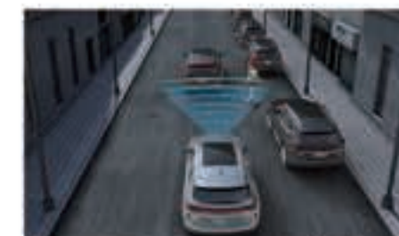
Autonomous Emergency Braking (AEB)