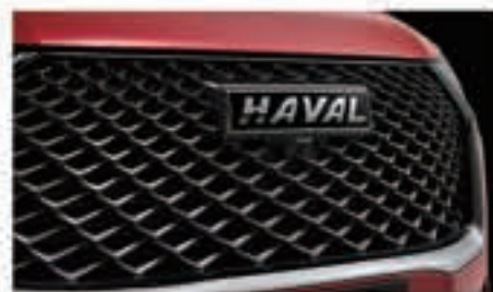
Fangsheng Pattern Grille (Double Auspice Pattern)