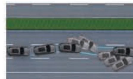
Electronic Stability Program (ESP)