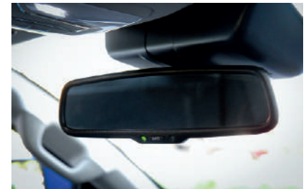
AUTO-DIMMING MIRROR & DASHCAM POWER OUTLET.