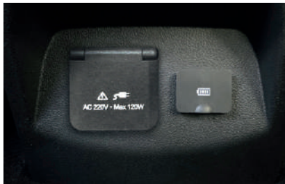
220V POWER OUTLET.

The ACC automatically adjusts the vehicle speed to maintain a safe following distance.