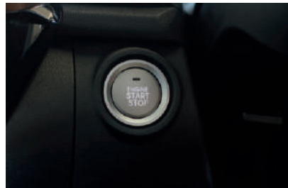
SMART KEYLESS ENTRY AND A PUSH START BUTTON.