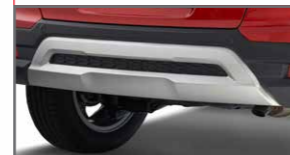
REAR BUMPER SKID PLATE

Allows you to see everything behind you when you park, reducing your chances of making a mistake.