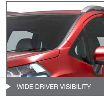
WIDE DRIVER VISIBILITY

Ensures protection no matter which seat your passengers are sitting in.