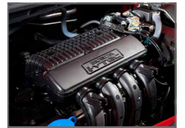
1.2L I-VTEC PETROL

Slim A-Pillar, large windscreen and front quarter glass