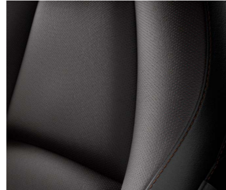
INDIVIDUAL MODEL Black leather