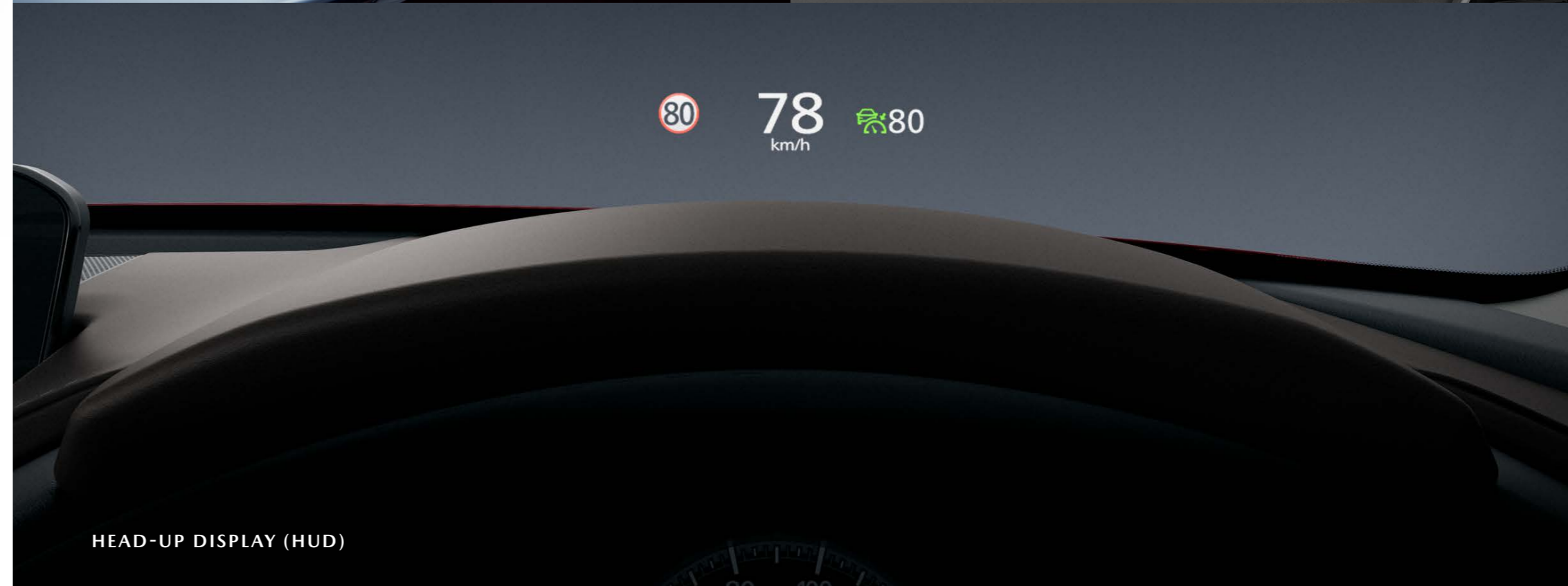
HEAD-UP DISPLAY (HUD)