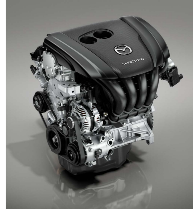
2.0 Litre SKYACTIV-G ◦ 121 kW @ 6000 rpm (max. power) ◦ 213 Nm @ 4000 rpm (max. torque)