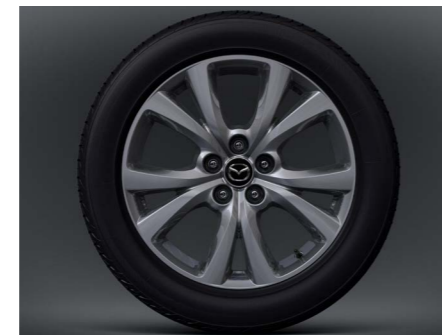
INDIVIDUAL MODEL 18" Alloy wheels (Silver Metallic)