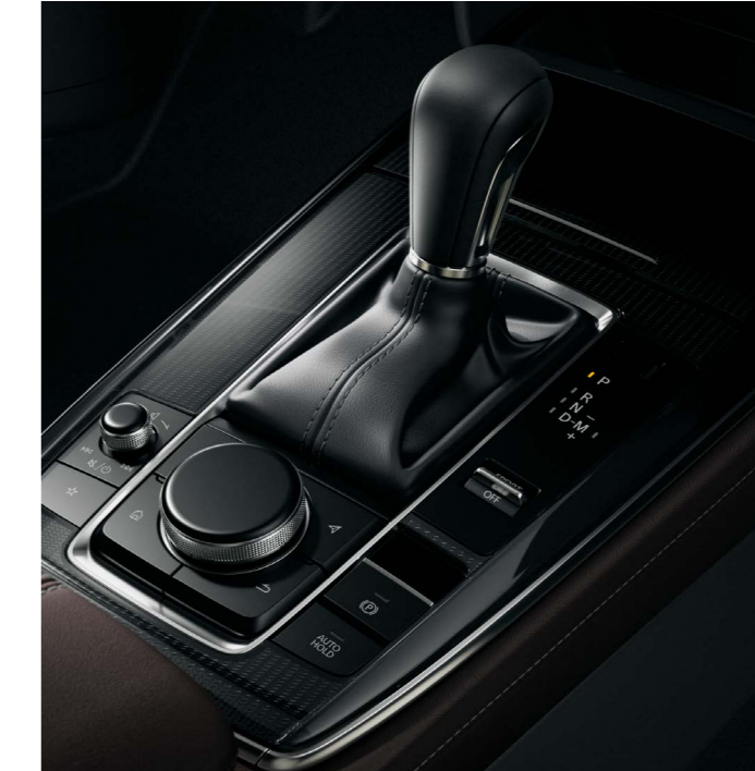
SKYACTIV-DRIVE TRANSMISSION 6-Speed Automatic transmission