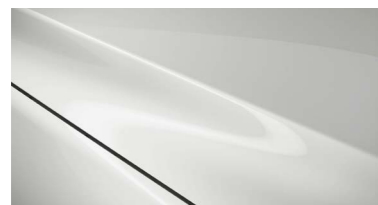
SNOWFLAKE WHITE PEARL