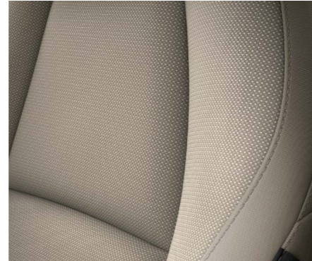
DYNAMIC MODEL Greige cloth (optional)