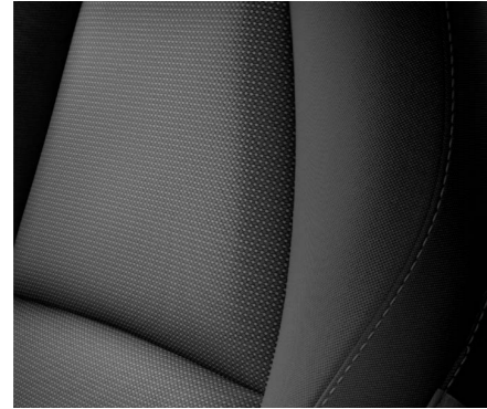
ACTIVE & DYNAMIC MODELS Black & dark grey cloth

When beauty means richness of colour and complexity of texture, the interior of the all-new Mazda CX-30 range fulfils a refined toughness that will leave a great impression on the driver. A sure fit for a quality driving experience.