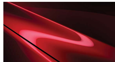
SOUL RED CRYSTAL