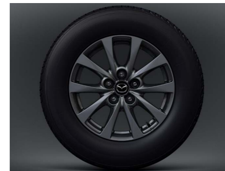
ACTIVE & DYNAMIC MODELS 16" Alloy wheels (Grey Metallic)