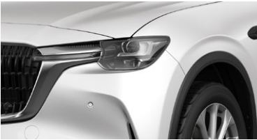
RHODIUM WHITE METALLIC