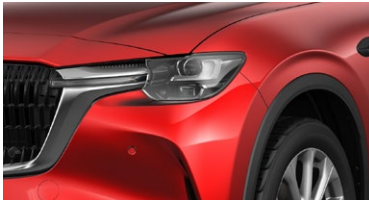
SOUL RED CRYSTAL