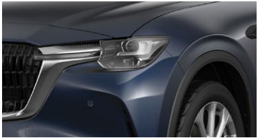
DEEP CRYSTAL BLUE