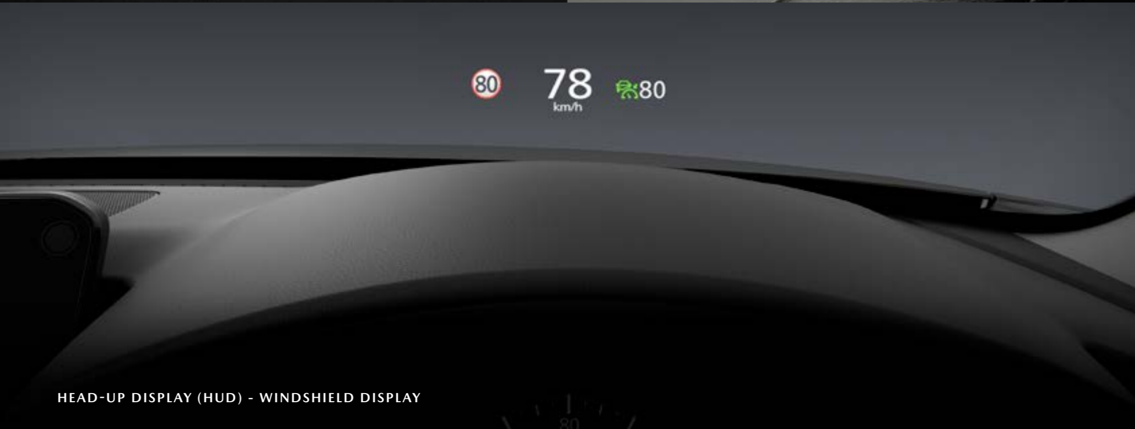
HEAD-UP DISPLAY (HUD) - WINDSHIELD DISPLAY