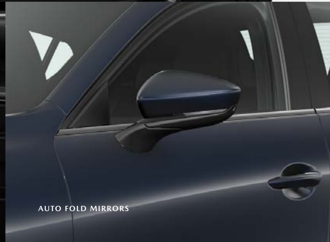
AUTO FOLD MIRRORS