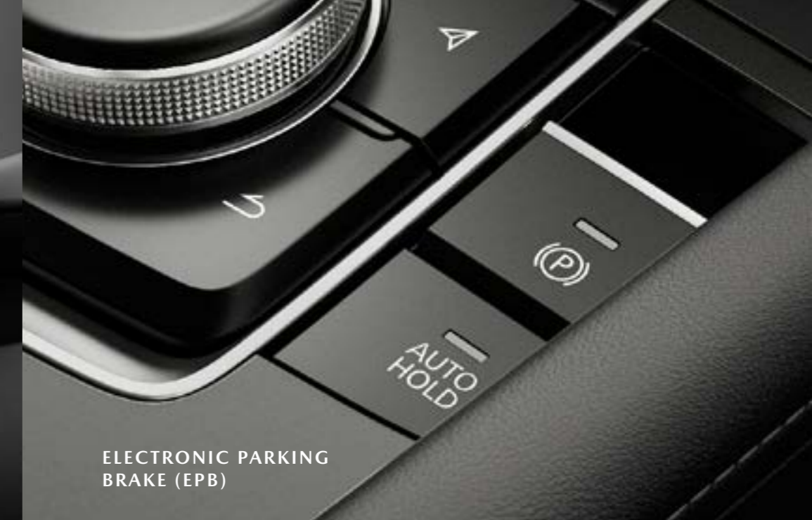
ELECTRONIC PARKING BRAKE (EPB)