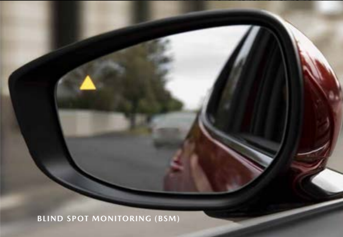
BLIND SPOT MONITORING (BSM)