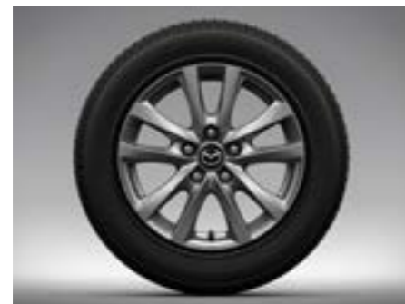
ACTIVE & DYNAMIC MODELS 16" Alloy wheels (Silver Metallic)