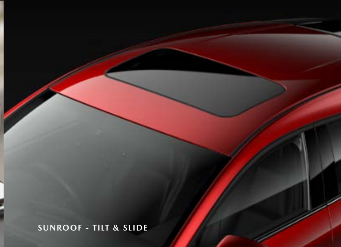
SUNROOF - TILT & SLIDE