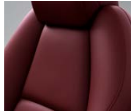
INDIVIDUAL & ASTINA MODELS Burgundy Red Leather*