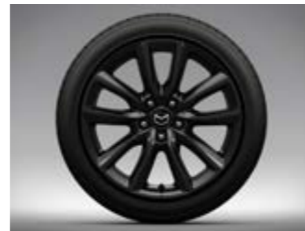
ASTINA MODEL 18" Alloy wheels (Black Metallic)