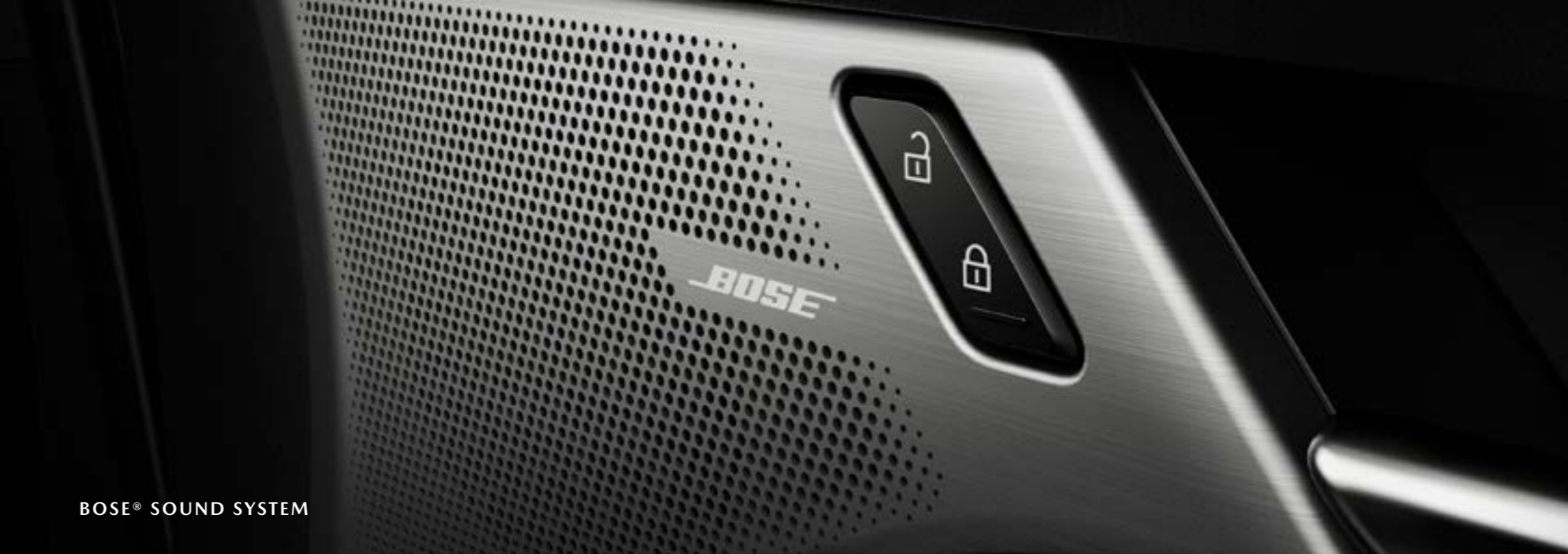
BOSE® SOUND SYSTEM