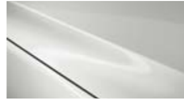
SNOWFLAKE WHITE PEARL