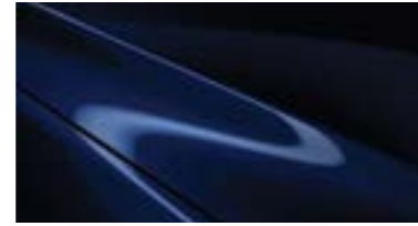
DEEP CRYSTAL BLUE