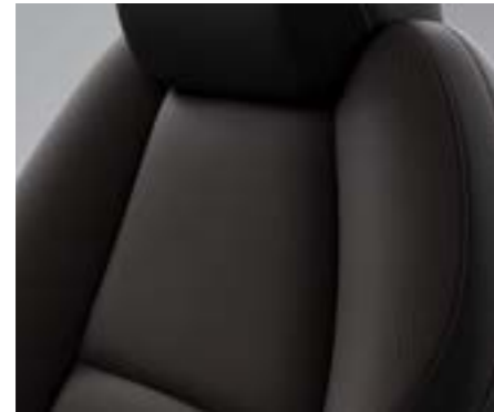
ACTIVE & DYNAMIC MODELS Black Cloth

When beauty means richness of colour and complexity of texture, the interior of the next-generation Mazda3 range fulfils a refined toughness that will leave a great impression on the driver. A sure fit for a quality driving experience.