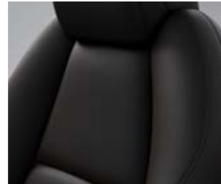
INDIVIDUAL & ASTINA MODELS Black Leather*