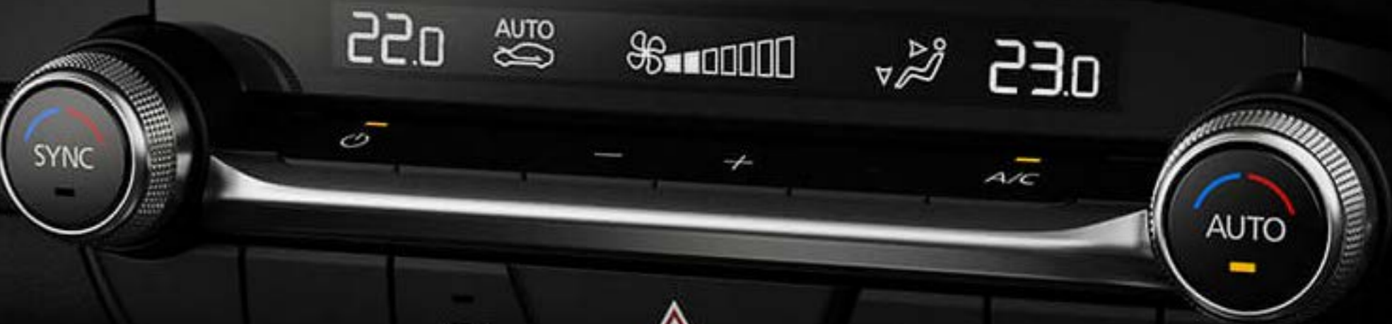
DUAL-ZONE CLIMATE CONTROL