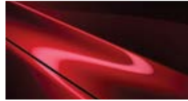
SOUL RED CRYSTAL