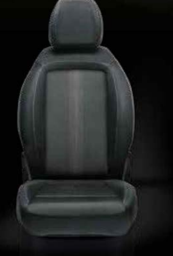
Fabric Skyline Black/Grey with double stitching