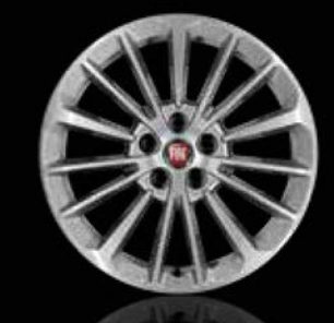
16" Alloy Wheels Diamond (City Life MT)