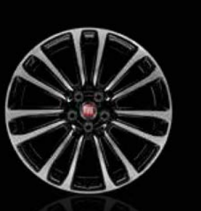
17" Alloy Wheels Diamond (City Life AT)