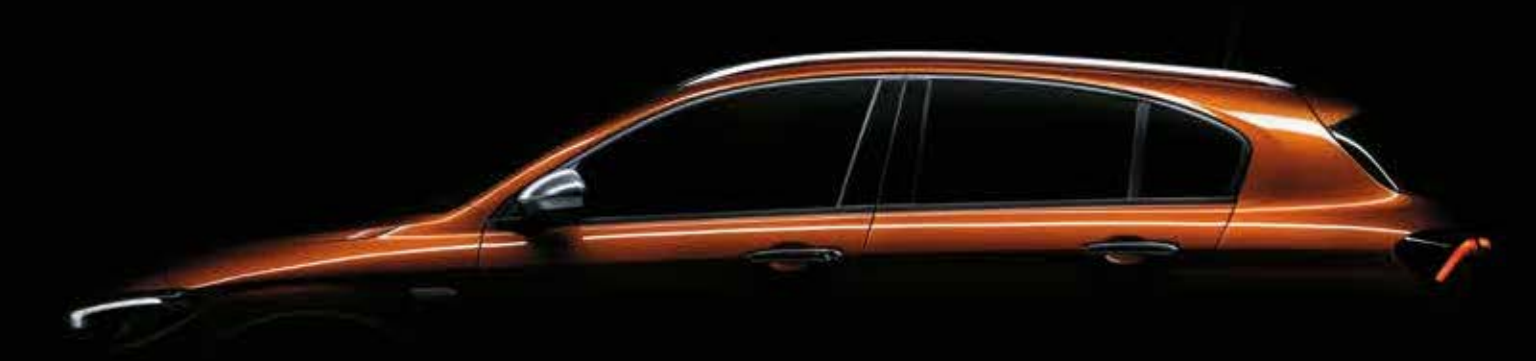
THE NEW TIPO