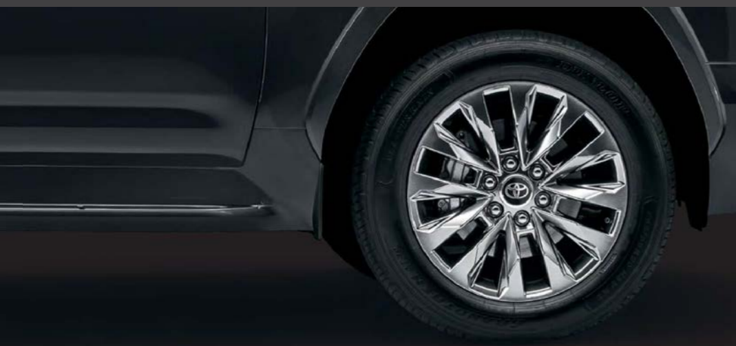
20" Alloy* Wheels

Whether you're travelling cross-country or battling in the bush, there's absolutely no doubt that the Land Cruiser 300 is engineered to handle the hard stuff, while keeping you comfortable and in control.