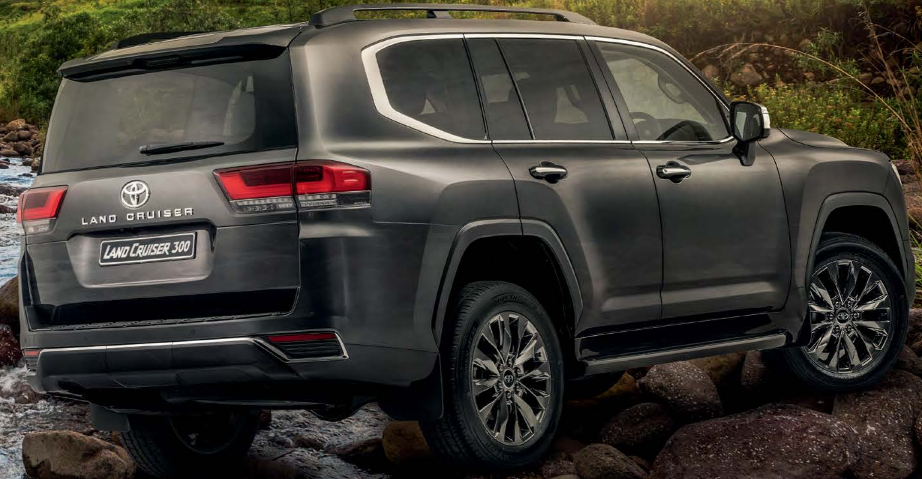
Model Shown: 3.5T V6 ZX |