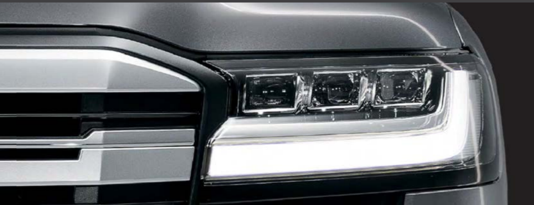
LED Adaptive High-beam System* and Daytime Running Lights