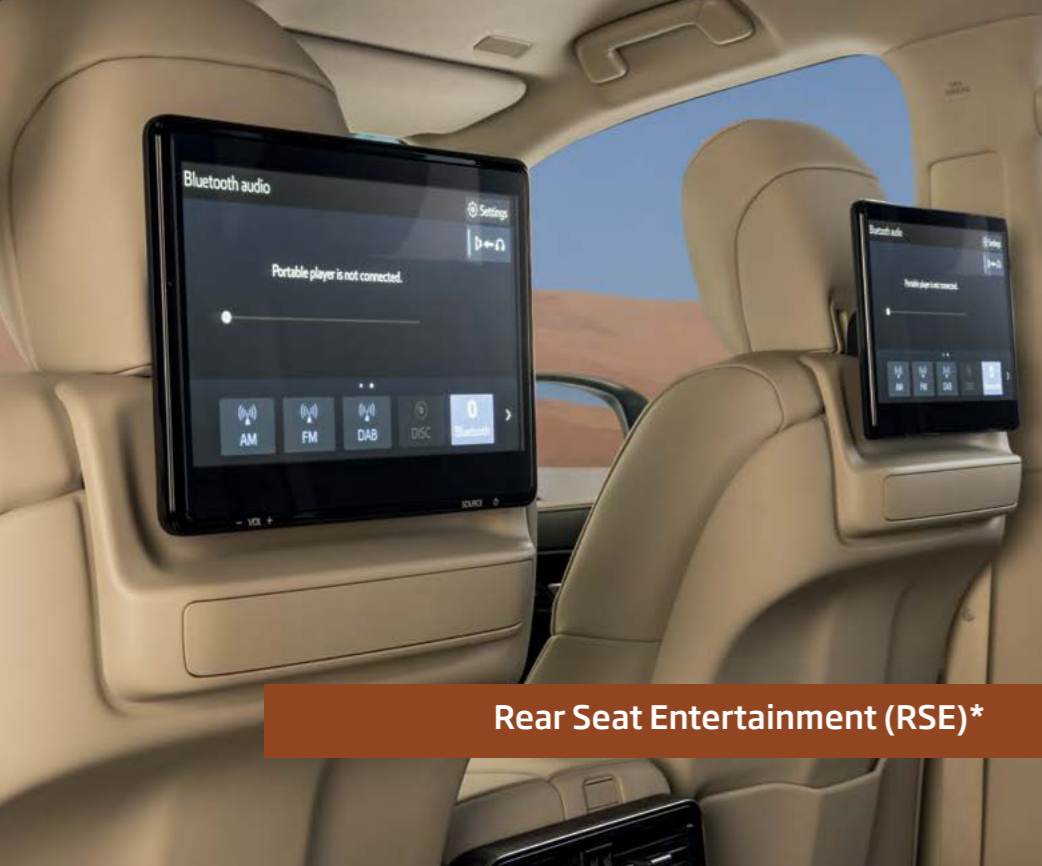
Rear Seat Entertainment (RSE)*

The 12.3"* Display Audio touchscreen infotainment system is linkable to smart devices by either Apple CarPlay or Android Auto and features USB and Bluetooth connectivity. Both display the screen of the smartphone on the vehicle's infotainment screen as well as linking the phone's audio output to the vehicle's 14 JBL* speakers. Use of this large, high-resolution screen enables the simultaneous display of multiple sources of information, such as multimedia and climate control. The reverse camera* image is also relayed to the high-resolution touchscreen infotainment display. During such movements, the vehicle's rear and surrounds are enhanced with on-screen reversing guidelines. This also occurs when the Multi-Terrain Monitor* (primarily used during off-roading) and Panoramic View Monitor* - which gives a bird's-eye view - are in use.