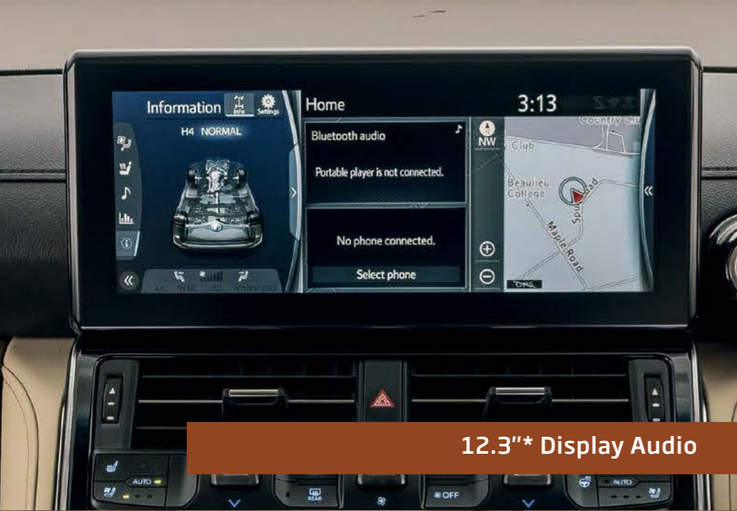
12.3"* Display Audio