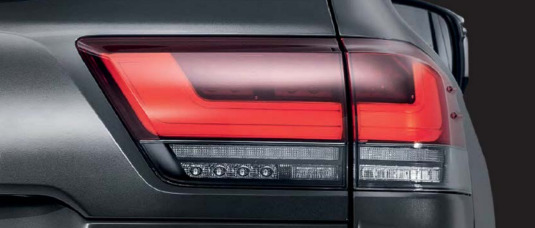
Rear LED* Lights