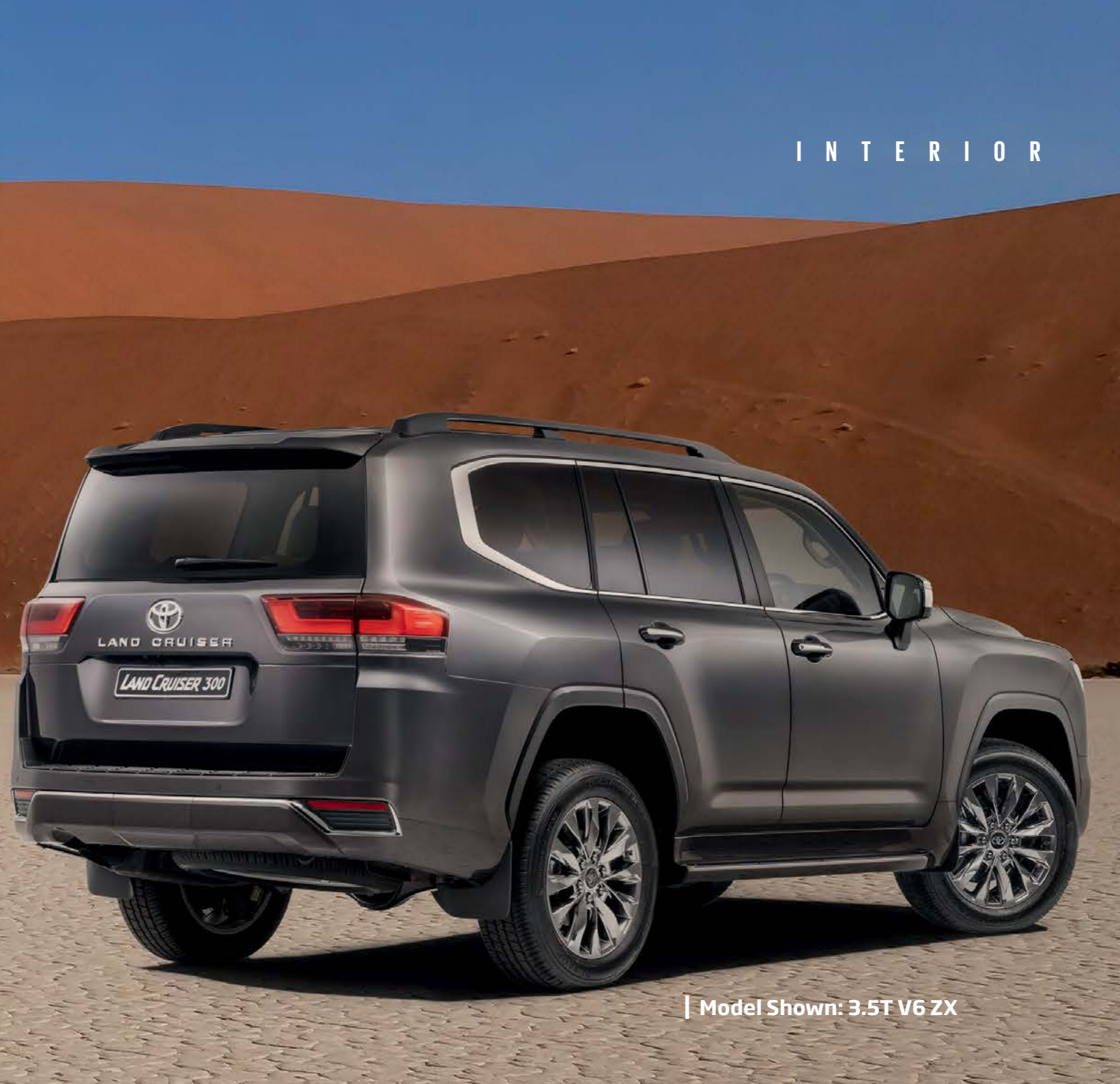
| Model Shown: 3.5T V6 ZX

Connect to the MyToyota App: All new Toyota vehicles now come fitted standard with a telematics device that opens up a whole new world of connected features. Upon dealer activation and registration to the MyToyota App, an array of smart connectivity, safety, and convenience features are enabled through your smartphone. The MyToyota App gives you more control of your driving experience by giving you access to a range of never seen before personalised offerings and real-time, customisable vehicle features, including on-board Wi-Fi**, roadside assistance, licence renewal and more. See the inside back cover for more information. **15GB Free data once-off upon activation. Ts & Cs Apply, Wi-Fi available in South Africa only. THE WORSE THE ROAD, THE BETTER THE DRIVE.