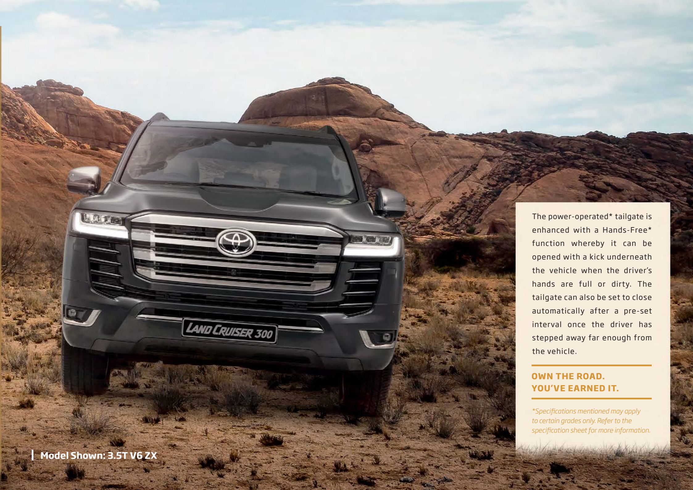
| Model Shown: 3.5T V6 ZX

The power-operated* tailgate is enhanced with a Hands-Free* function whereby it can be opened with a kick underneath the vehicle when the driver's hands are full or dirty. The tailgate can also be set to close automatically after a pre-set interval once the driver has stepped away far enough from the vehicle.