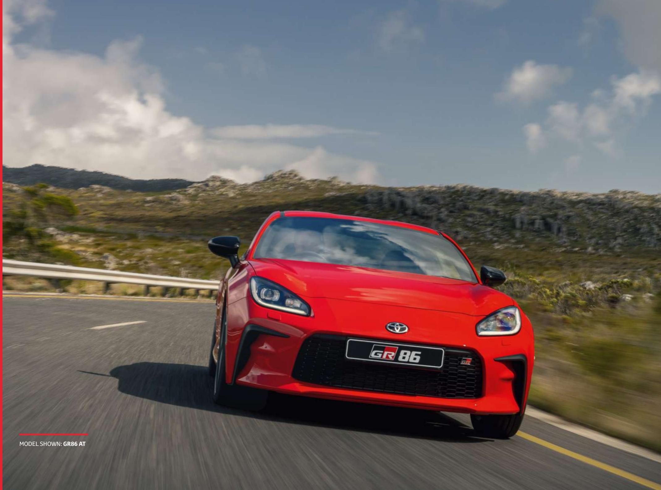
MODEL SHOWN: GR86 AT