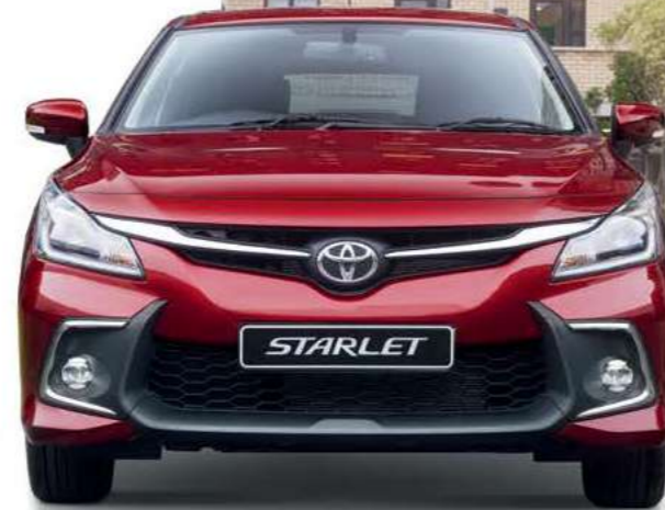
MODEL SHOWN: STARLET 1.5 Xr AUTOMATIC

While the Toyota Starlet lets you maximise every moment of your life, it's also always there to keep you safely on the road.