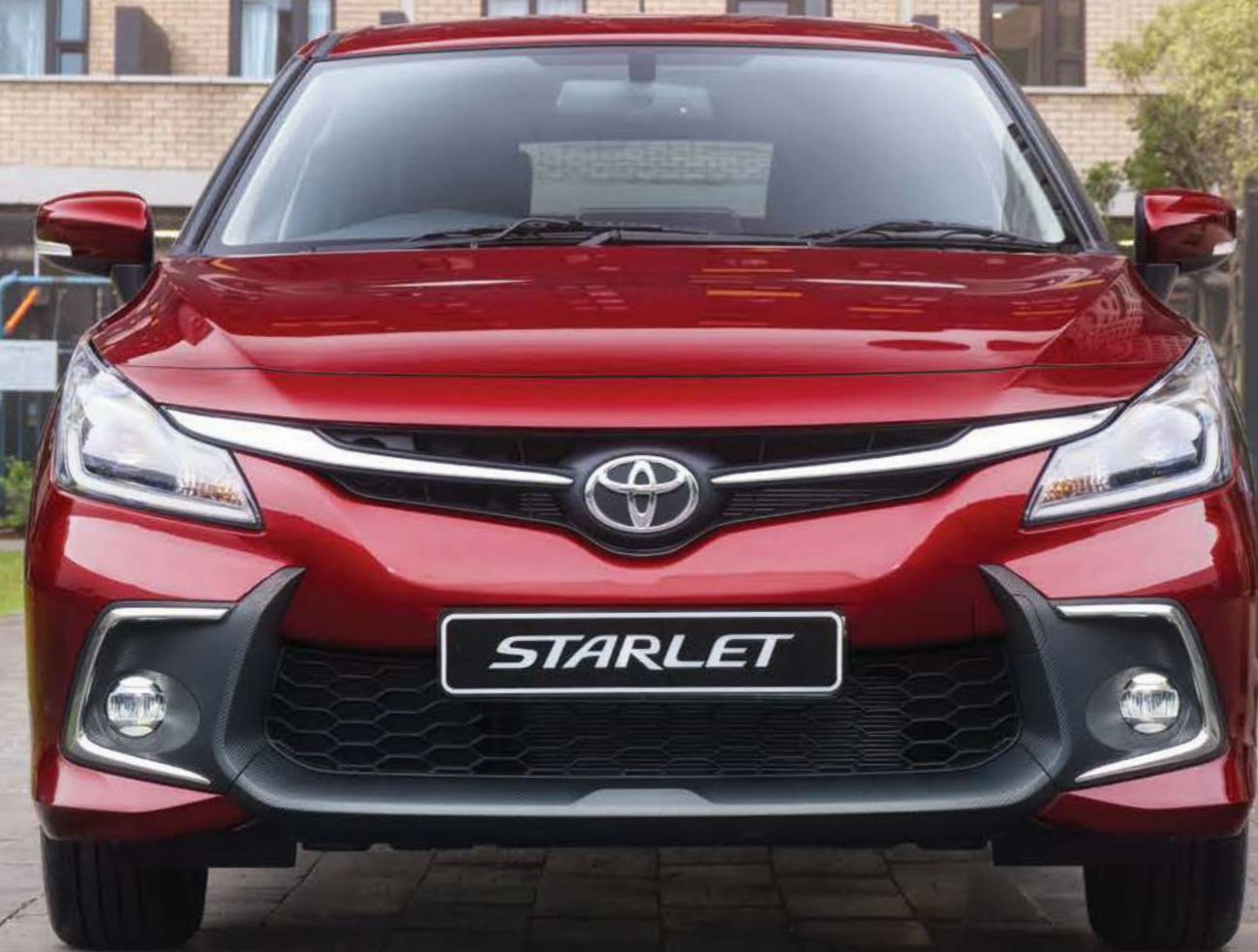
MODEL SHOWN: STARLET 1.5 Xr AUTOMATIC