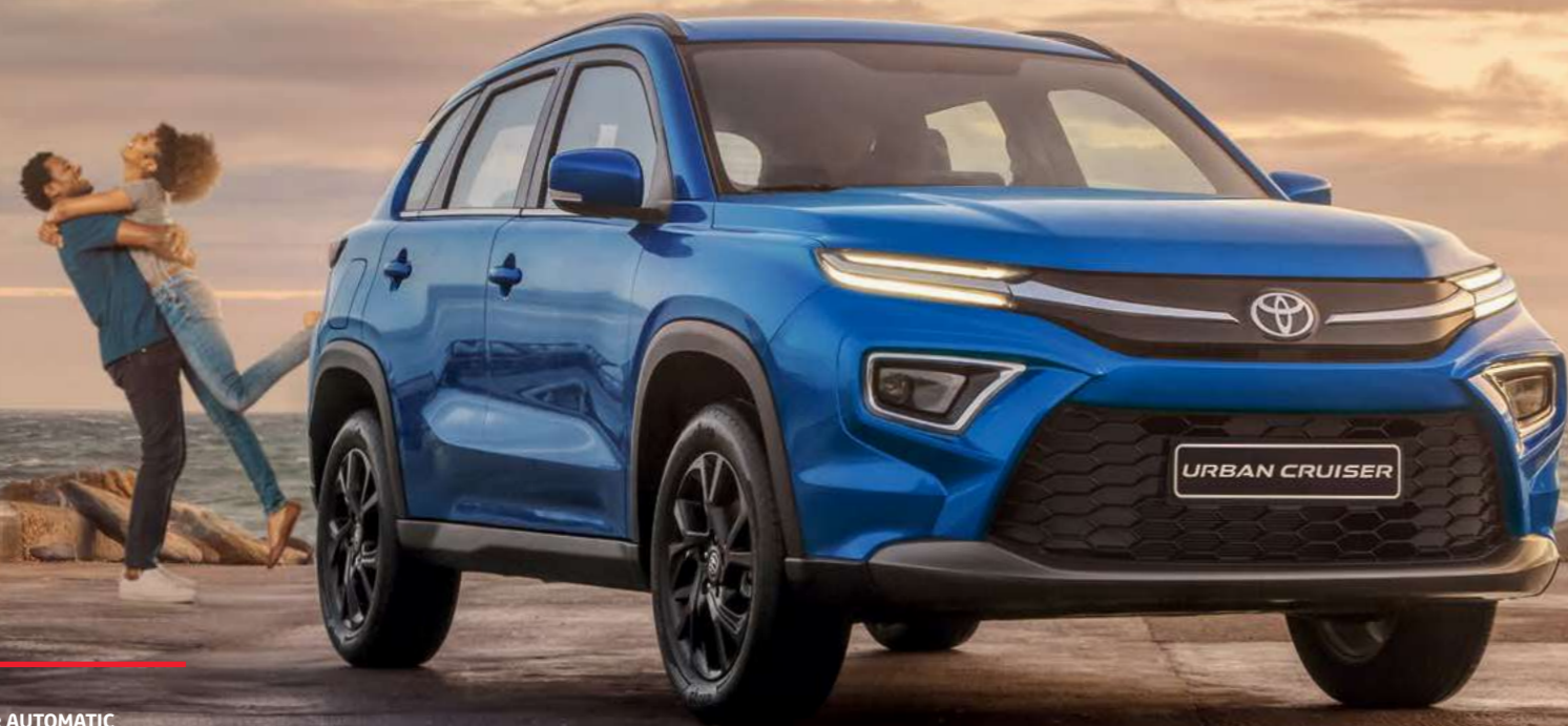
MODEL SHOWN: URBAN CRUISER 1.5 Xr AUTOMATIC