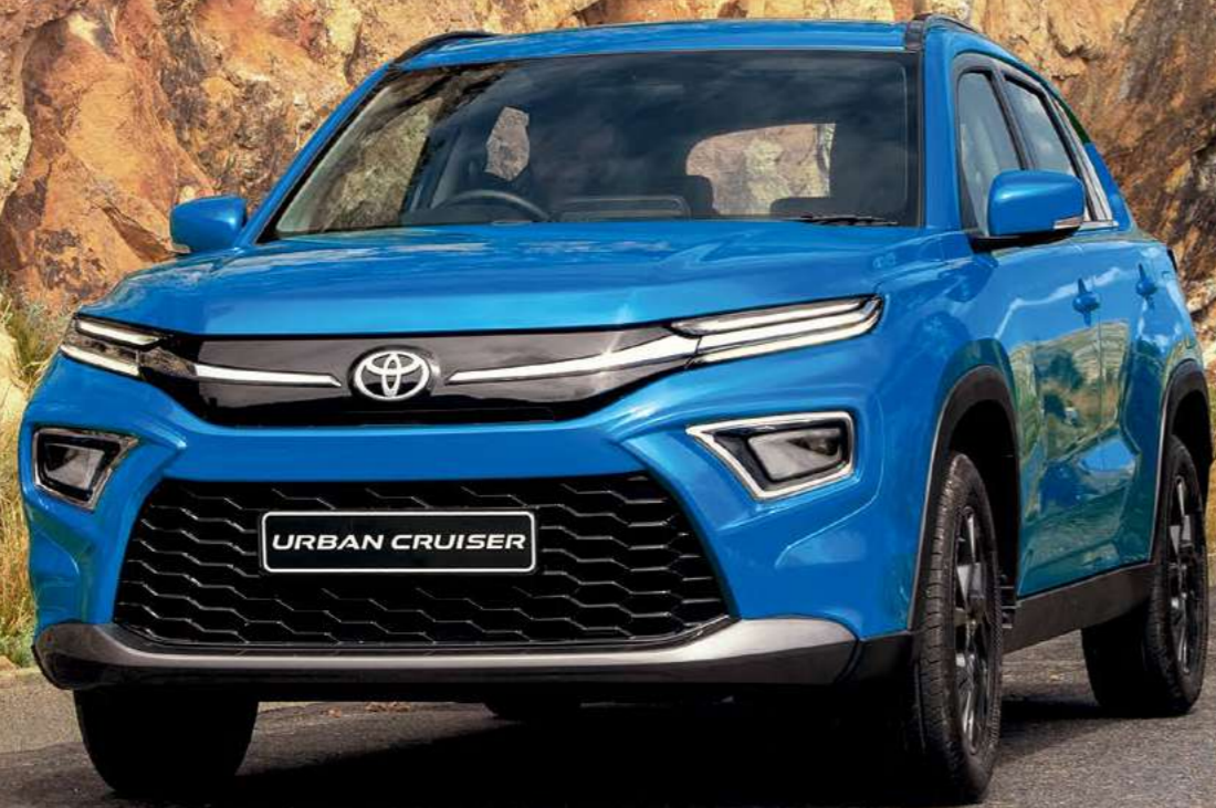
MODEL SHOWN: URBAN CRUISER 1.5 Xr AUTOMATIC