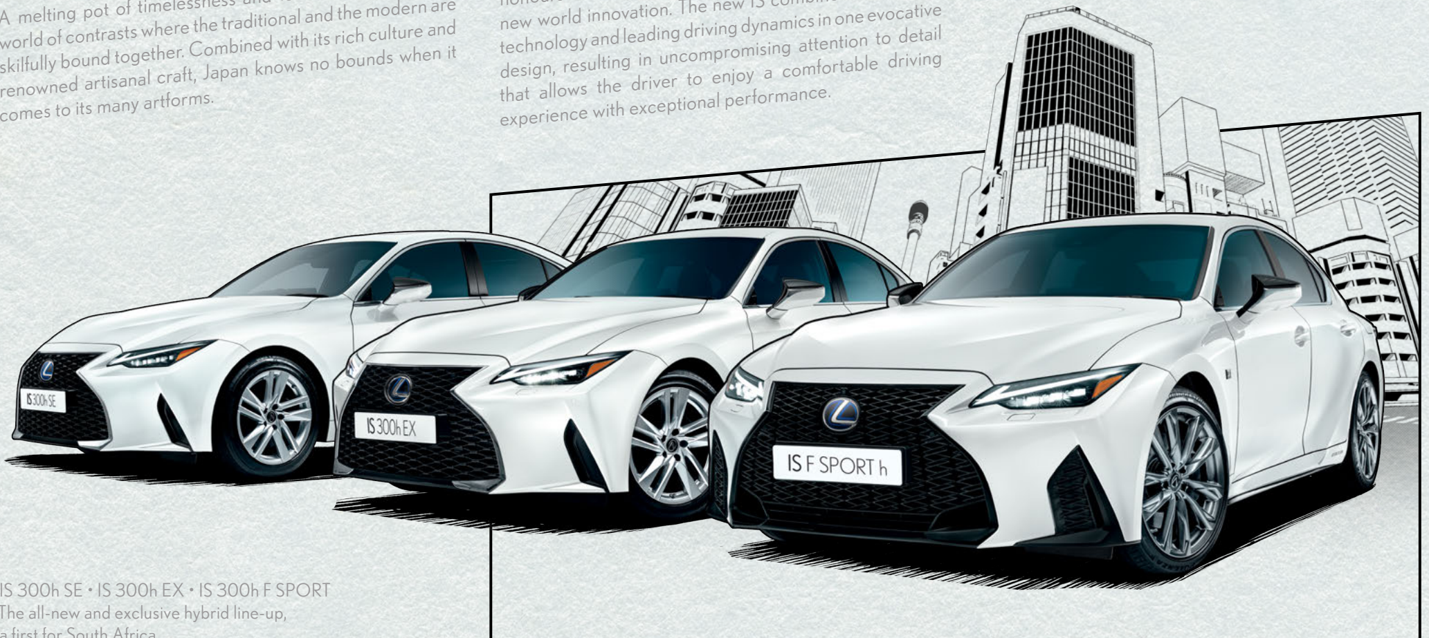
IS 300h SE • IS 300h EX • IS 300h F SPORT The all-new and exclusive hybrid line-up, a first for South Africa.

From the luxurious interior to the eye-catching exterior, the touch of our Takumi craftsmen has been applied to every inch of this sporty sedan.