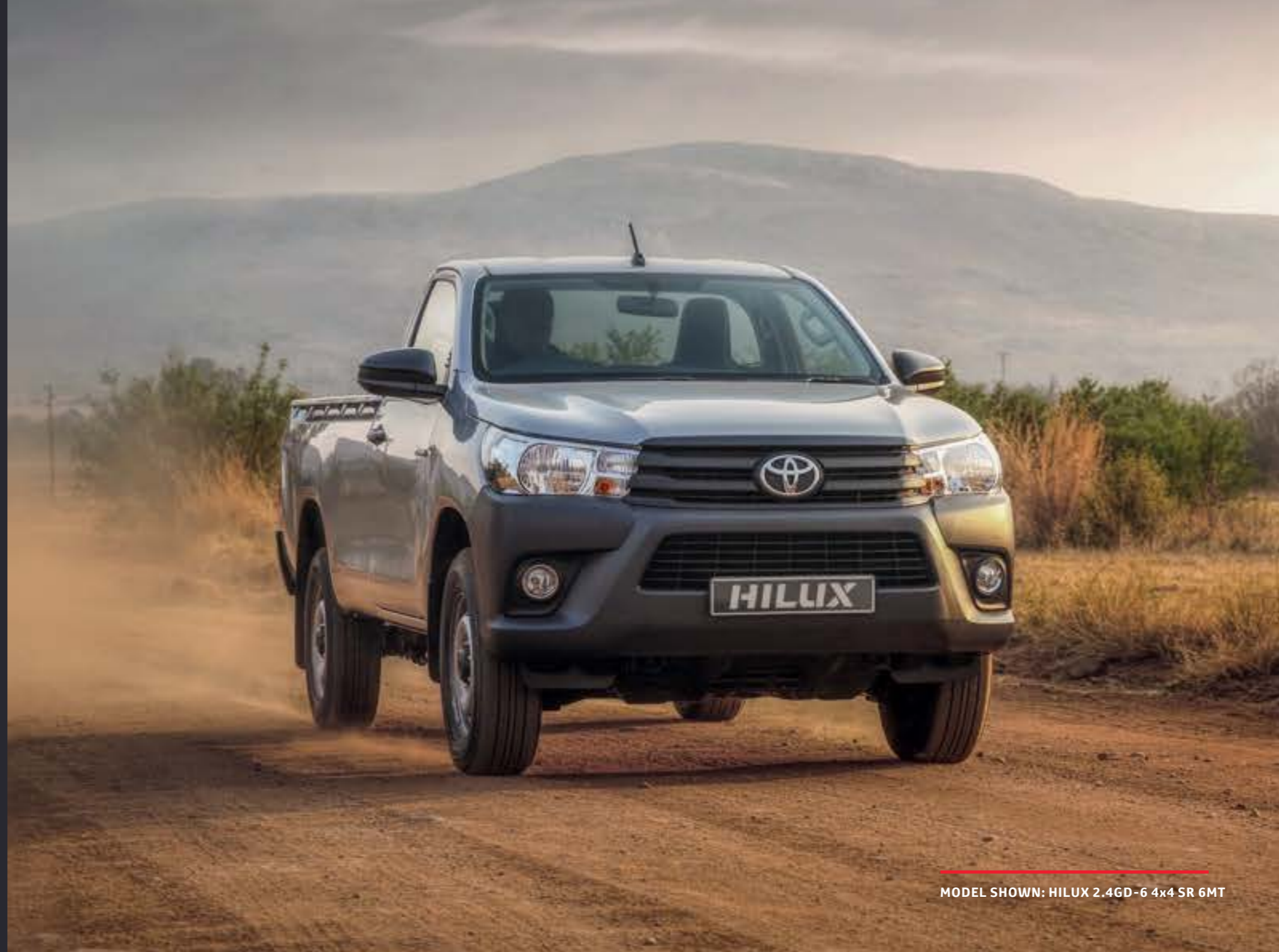
MODEL SHOWN: HILUX 2.4GD-6 4x4 SR 6MT

ALL NEW HILUX MODELS ARE INSTALLED WITH ADVANCED SECURITY TECHNOLOGY