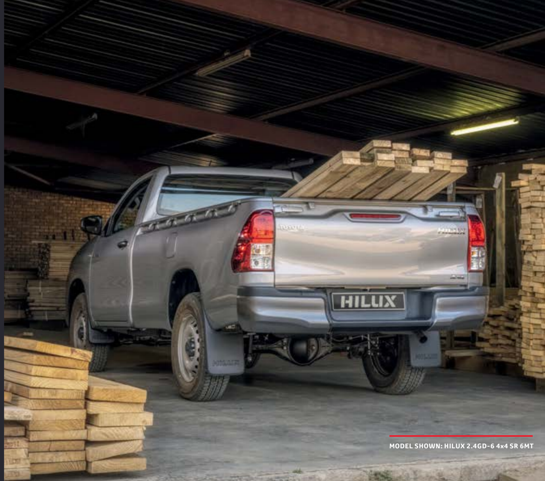
MODEL SHOWN: HILUX 2.4GD-6 4x4 SR 6MT

The upgraded styling on the Raider includes improvements to the engine hood, front bumper, lower guard and bumper corners supporting the protruding grille. The front bumper is colour-coded with a prominent horizontal axis extending across the headlamps and upper grille. And the front trapezoidal, thick frame grille is now a tougher-looking and enviable chrome and black.