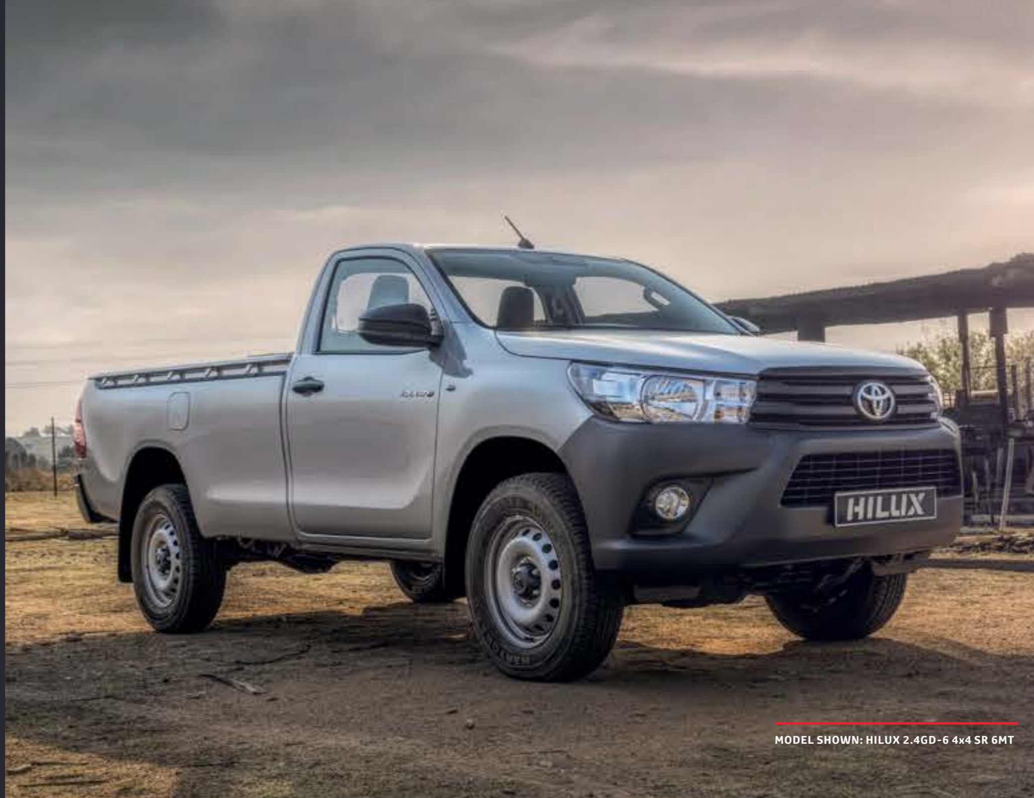
MODEL SHOWN: HILUX 2.4GD-6 4x4 SR 6MT

THE HILUX SINGLE CAB WORKHORSE IS THE VERY DEFINITION OF "NEVER SAY DIE". A TRUE EMBODIMENT OF THE LEGENDARY TOUGHNESS YOU'VE COME TO EXPECT FROM A BAKKIE WEARING A HILUX BADGE. NOW MORE THAN EVER YOU NEED WHAT IT TAKES TO GET THE JOB DONE, AND YOU NEED A PARTNER YOU CAN RELY ON NO MATTER HOW DIFFICULT THE TASK. WITH A HILUX WORKHORSE BY YOUR SIDE YOU CAN GO OUT THERE, GET YOUR HANDS DIRTY AND SHOW THEM WHAT YOU'RE MADE OF. DISCOVER A WORLD WHERE YOU CAN TAKE BOTH THE GOOD AND THE BAD IN YOUR STRIDE AS YOU DISCOVER HOW TOUGHNESS AND CONQUERING ANY CHALLENGE IS JUST A WAY OF LIFE WITH THIS BEAST OF BURDEN.