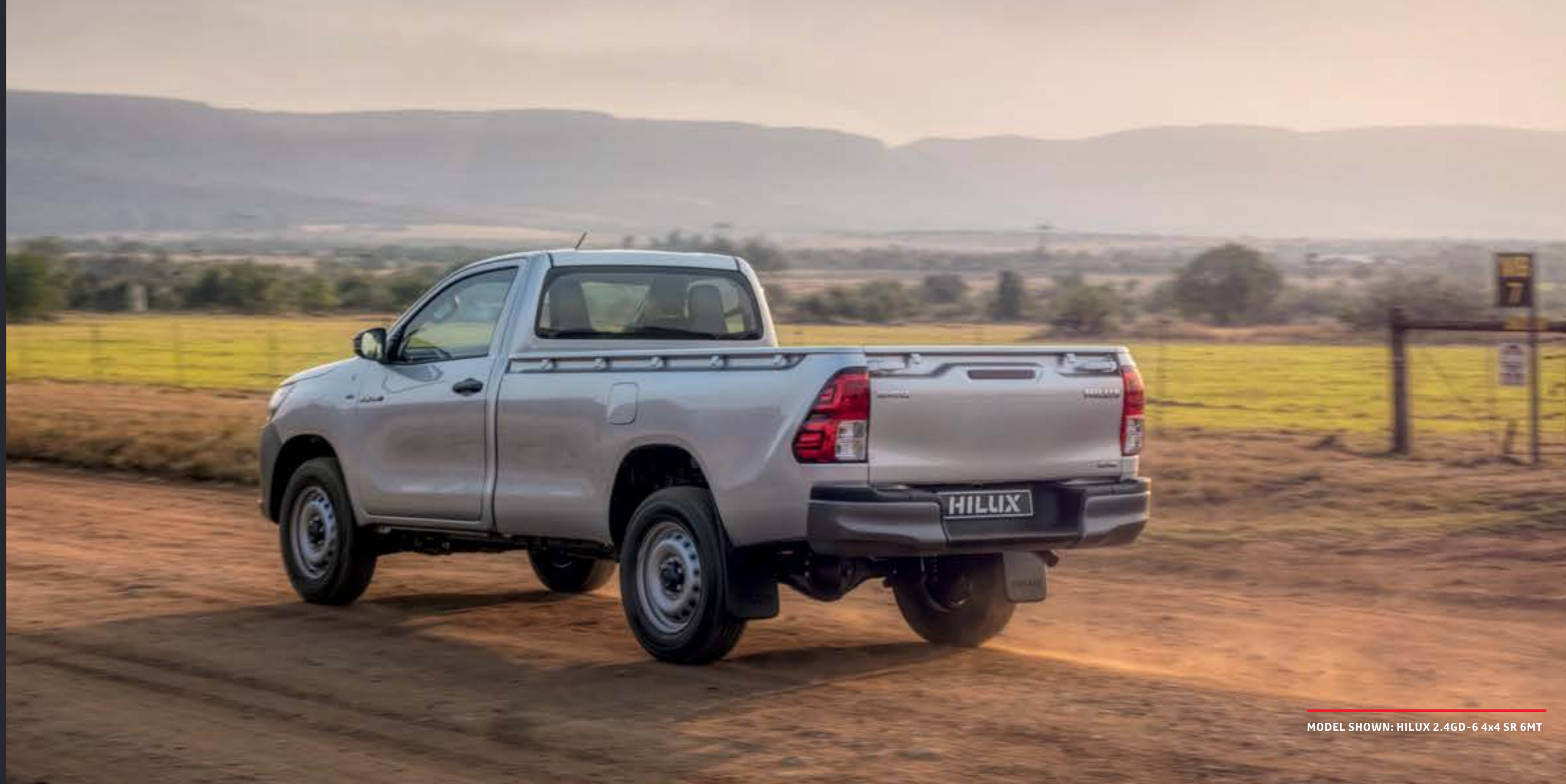
MODEL SHOWN: HILUX 2.4GD-6 4x4 SR 6MT