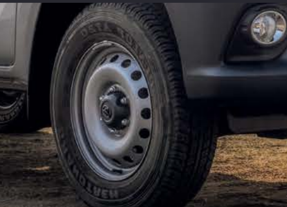
17" STEEL WHEELS*