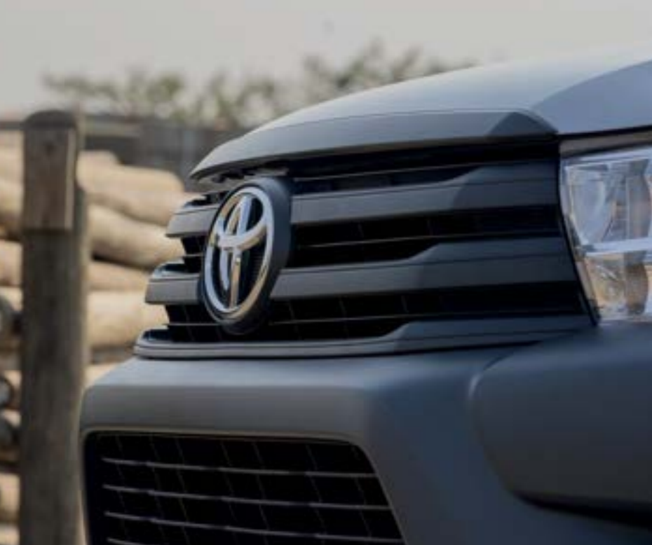
BLACK FRONT BUMPER*