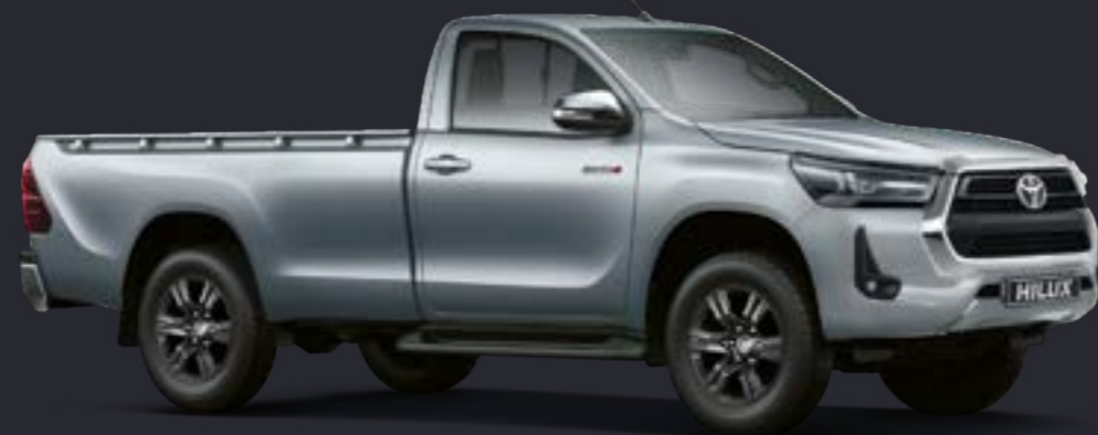
MODEL SHOWN: Hilux 2.8 GD-6 Raised Body Raider 6AT

NOTHING SHOUTS "BRING IT ON" LIKE A BOLDLY STYLED BAKKIE. BRINGING OUT THE BEST IN THE NEW MODELS – AND YOU – IS AN AGGRESSIVE EXTERIOR PACKAGE THAT CHALLENGES THE STATUS QUO.