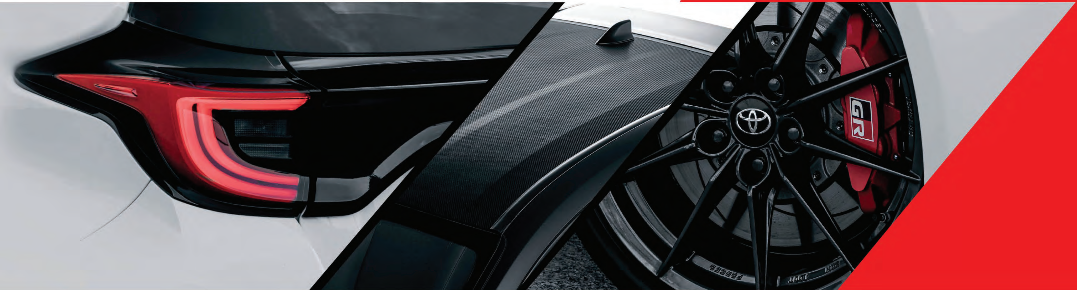
Model shown: GR Yaris Rally