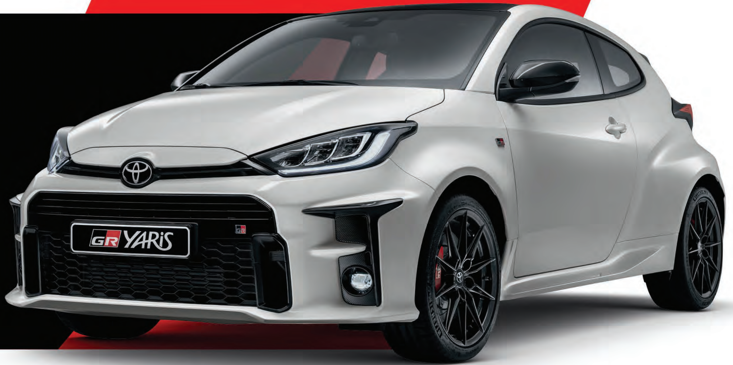
Model shown: GR Yaris Rally