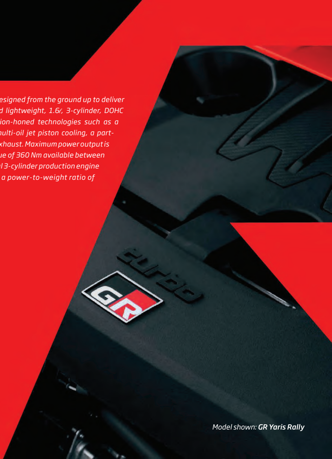
Model shown: GR Yaris Rally

Introducing one of the most powerful production 3-cylinder engines in the world. At Gazoo Racing, we believe that racing improves the breed. That's why Gazoo Racing-enhanced road vehicles like the GR Yaris personify the achievements of Toyota's victories at some of the world's most gruelling motorsport events, such as the Dakar Rally, the 24 hours of Le Mans and the World Rally Championship.