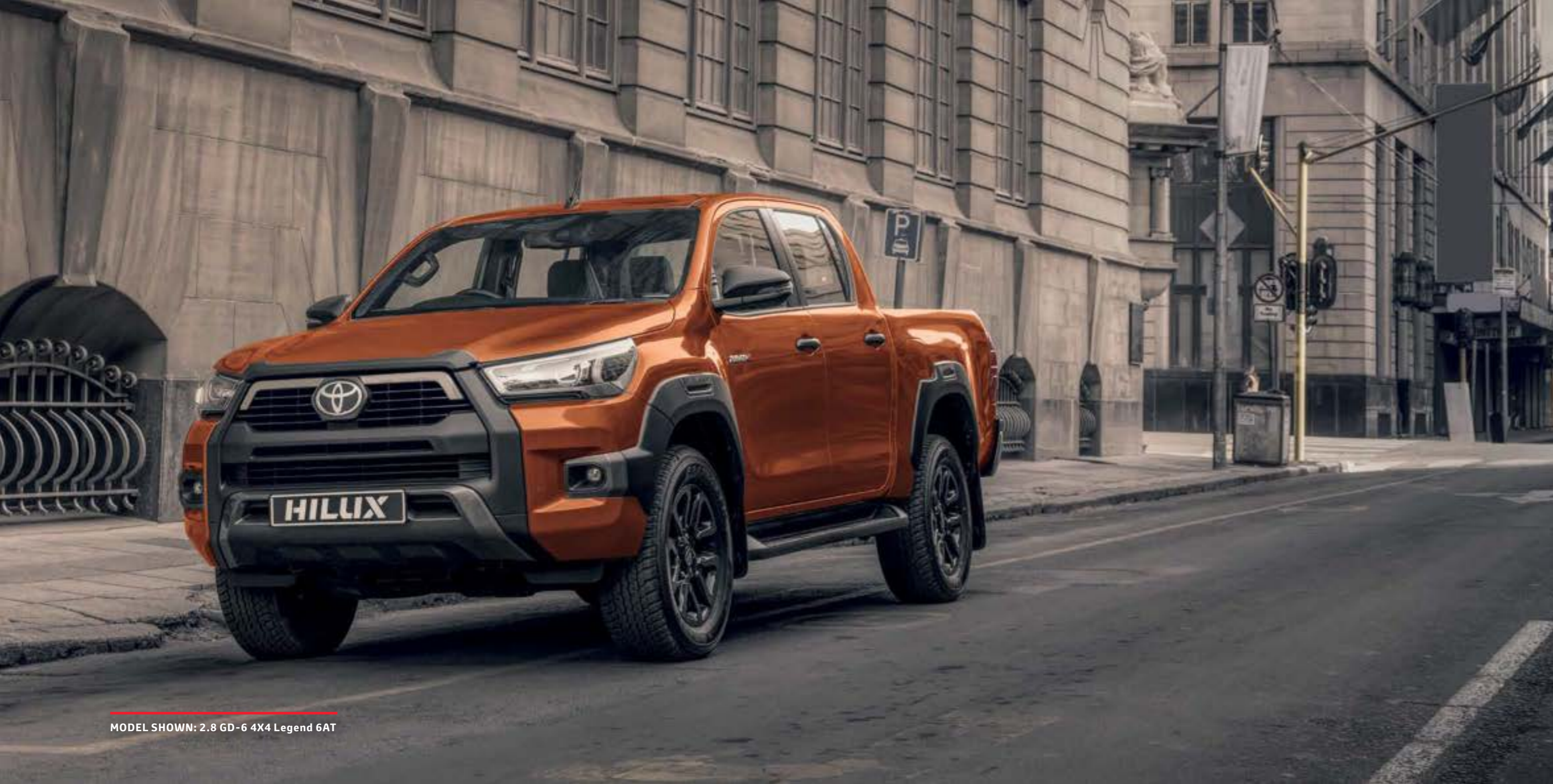
MODEL SHOWN: 2.8 GD-6 4X4 Legend 6AT