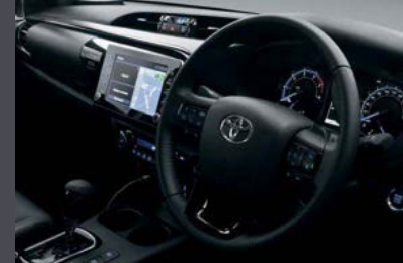
LEATHER-CLAD STEERING WHEEL*