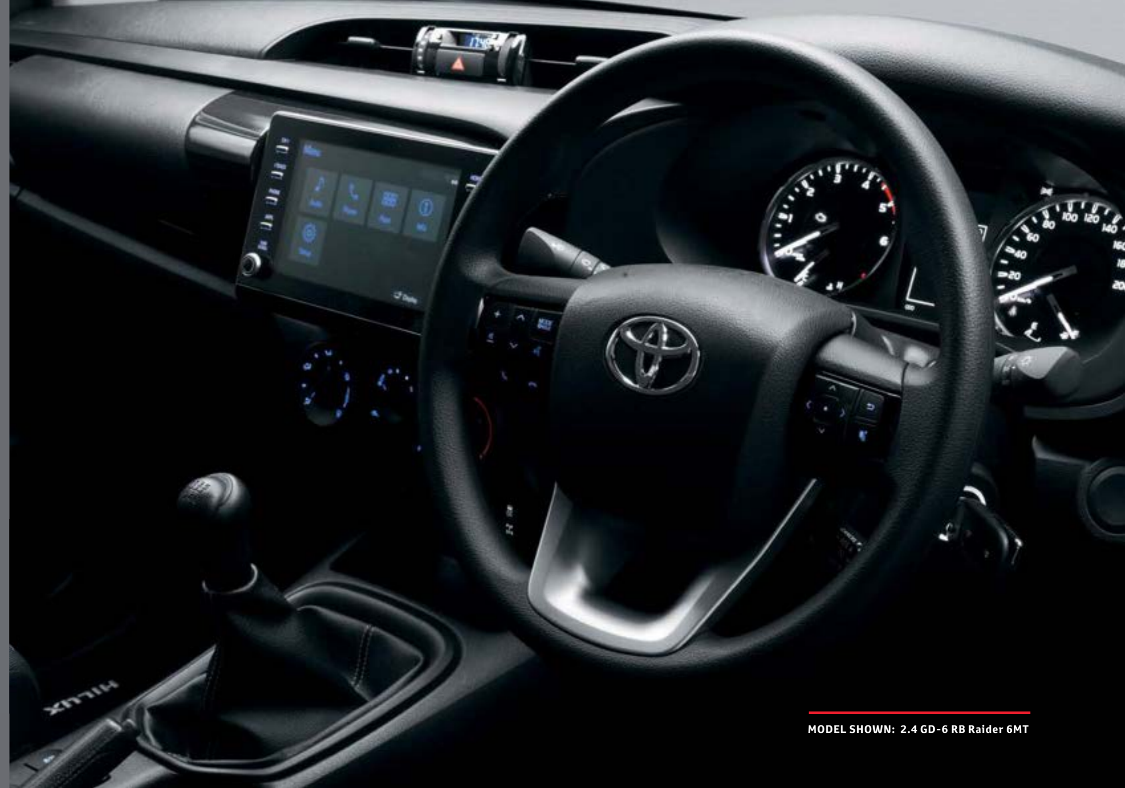
MODEL SHOWN: 2.4 GD-6 RB Raider 6MT

Additionally, the Display Audio infotainment unit has been upgraded to incorporate Apple CarPlay and Android Auto for full smartphone integration with the vehicle's infotainment system.