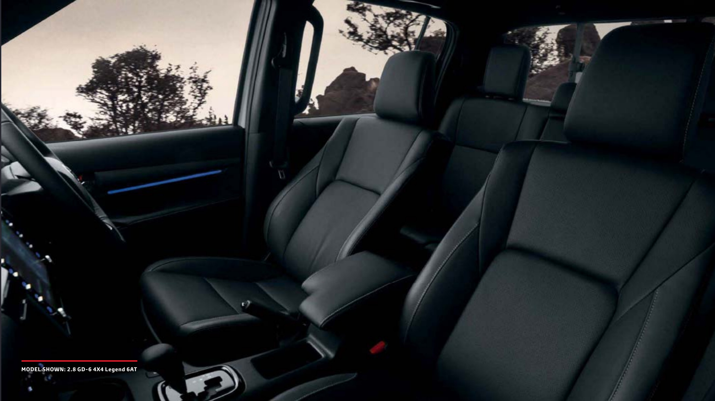
MODEL SHOWN: 2.8 GD-6 4X4 Legend 6AT