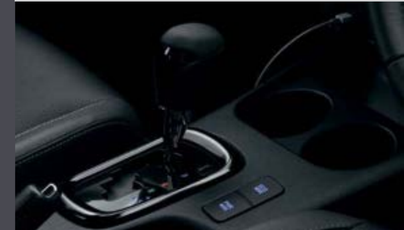
LEATHER-CLAD GEAR SELECTOR*