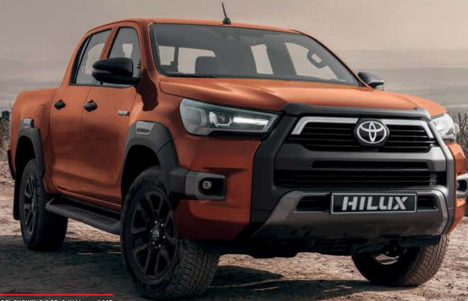
MODEL SHOWN: 2.8 GD-6 4X4 Legend 6AT