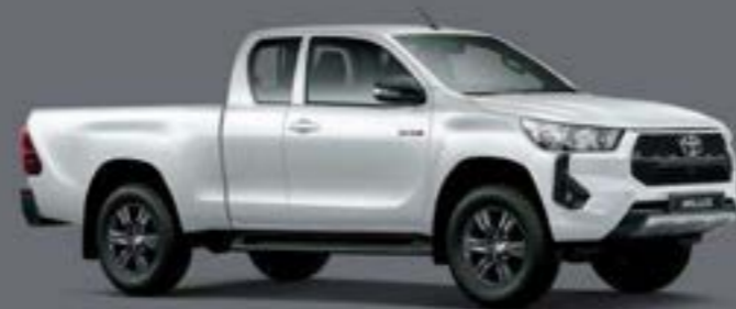
MODEL SHOWN: HILUX 2.4GD-6 RB Raider 6AT