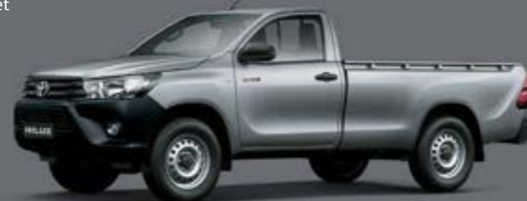
MODEL SHOWN: HILUX 2.4 GD-6 RB SR 6MT

Drivers can look forward to one-touch driver* electric window operation, and air conditioner*.