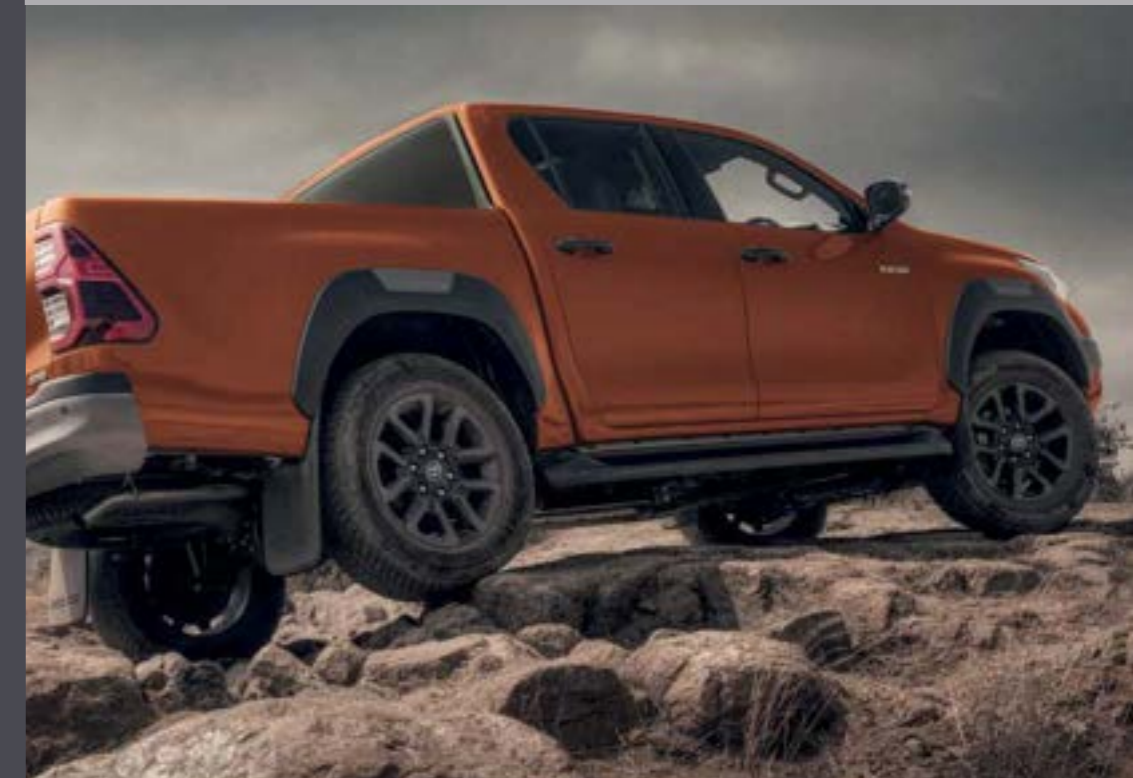
LEGEND BLACK ACCENTS