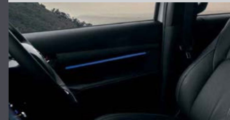
BLUE AMBIENT LIGHTING*