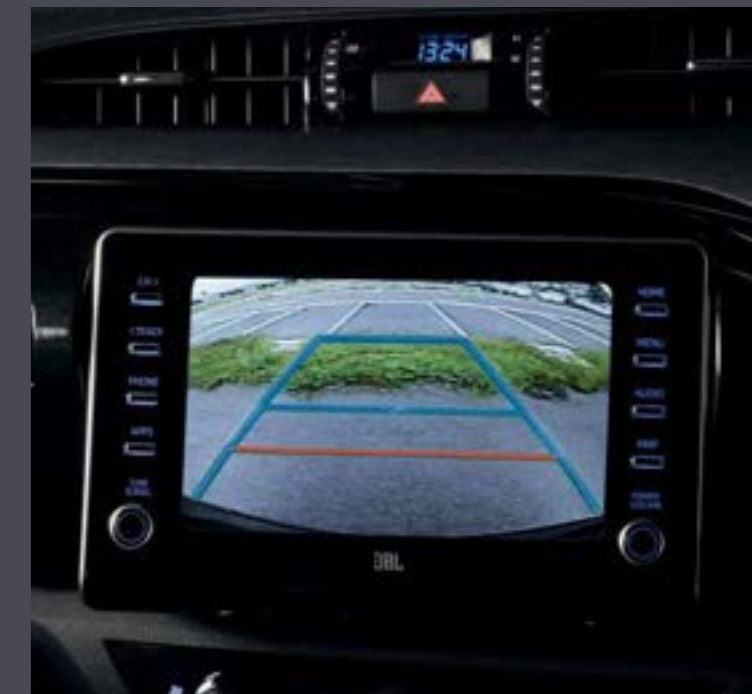
REVERSE CAMERA DISPLAY*