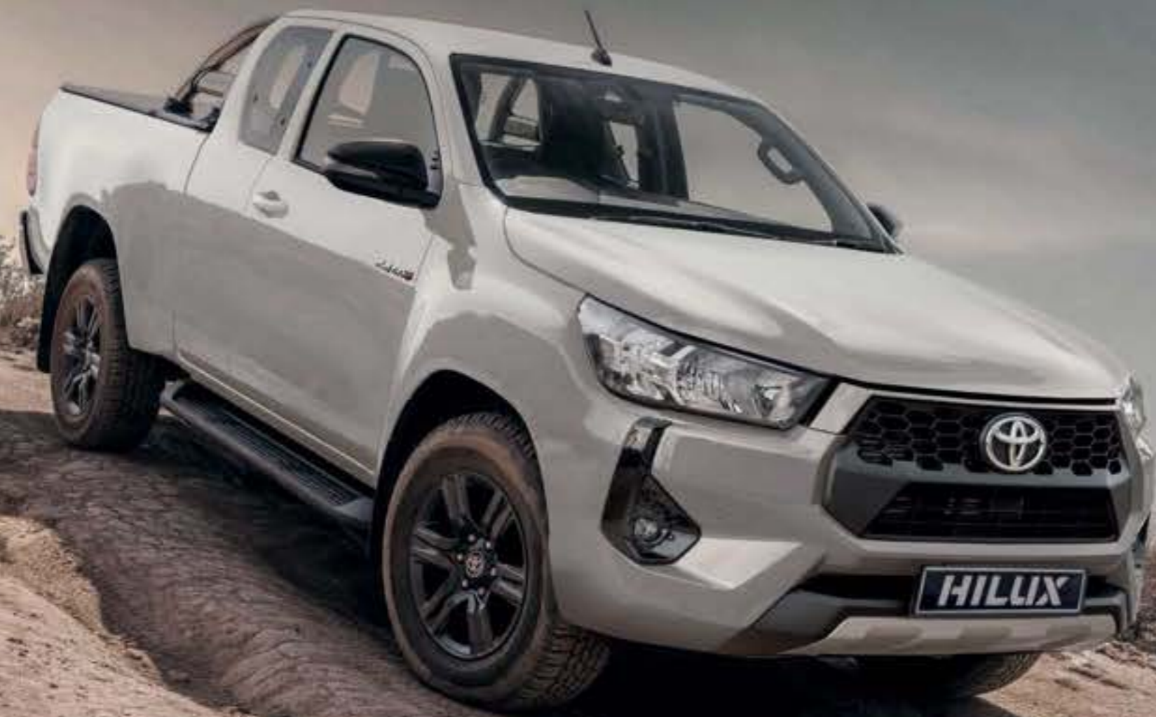
MODEL SHOWN: 2.4 GD-6 Raised Body Raider 6AT