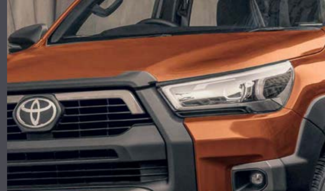
INTEGRATED LED DAYTIME RUNNING LIGHTS (DRL)