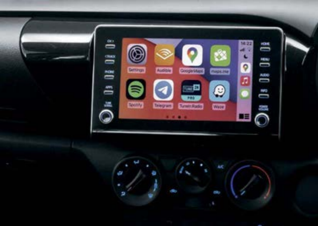
RAIDER: TOUCH SCREEN DISPLAY AUDIO