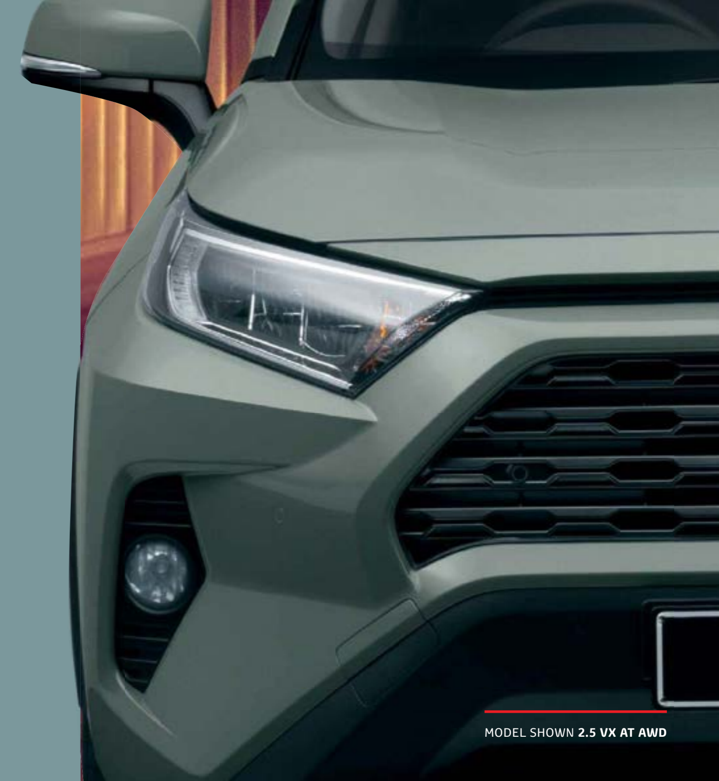
MODEL SHOWN 2.5 VX AT AWD