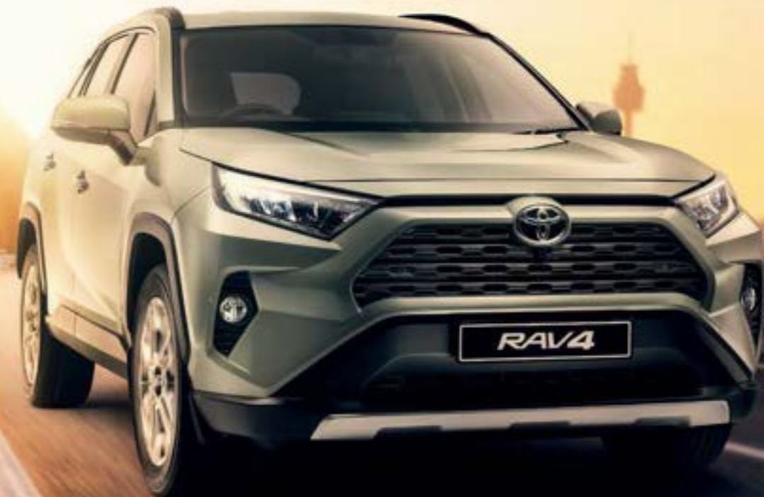
MODEL SHOWN 2.5 VX AT AWD

'INCREDIBLE' IS IN THE PEACE OF MIND OF KNOWING YOU CAN LIVE YOUR LIFE TO THE FULLEST AND BE SAFE AND SECURE WHILE DOING IT. THE RAV4 ENSURES THIS WITH AN EXTENSIVE RANGE OF ACTIVE AND PASSIVE SAFETY SYSTEMS.