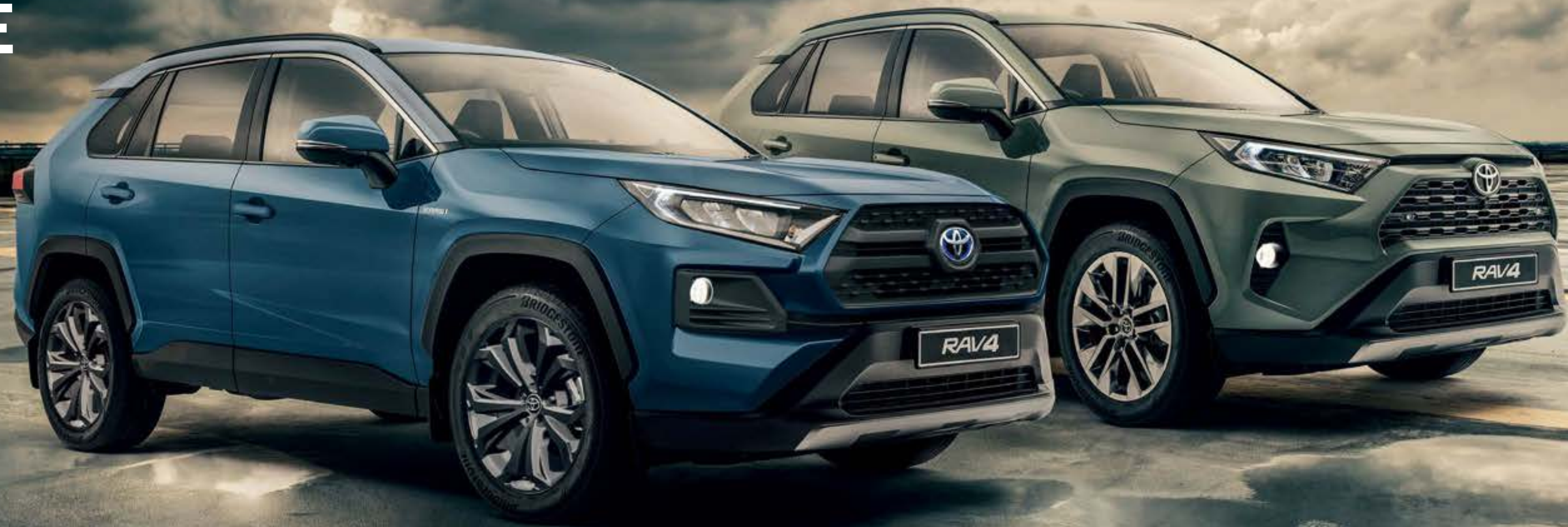
MODELS SHOWN GX-R CVT HYBRID E-FOUR | 2.5 VX AT AWD