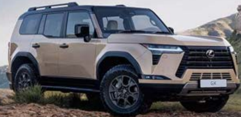
▼ GX 550 OVERTRAIL