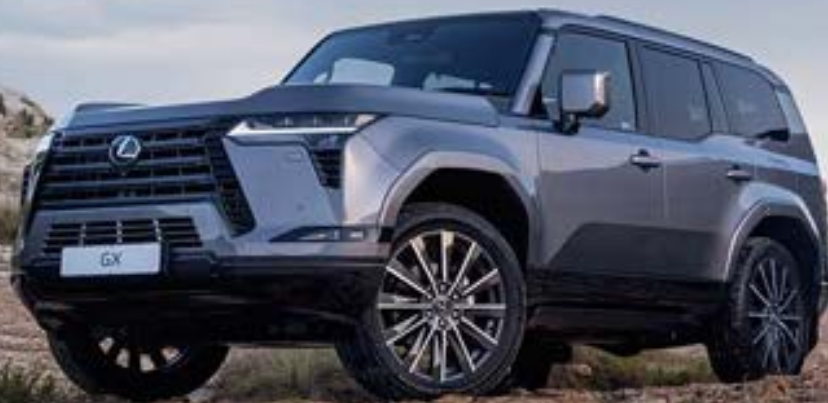
▼ GX 550 SE