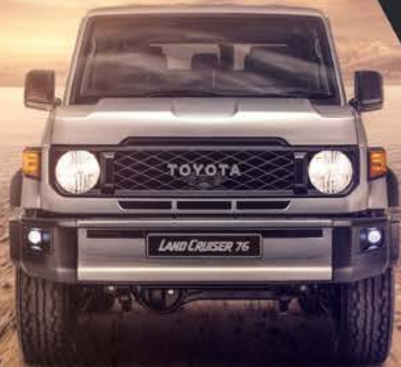
MODELS SHOWN: LC76 2.8 GD-6 SW 6AT