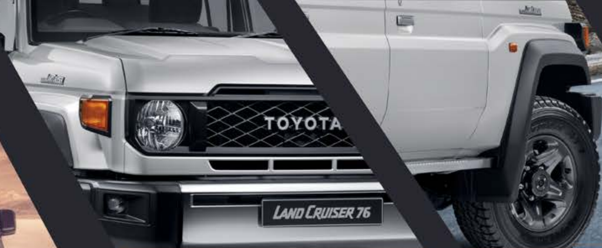
Rugged grille with plated bumper