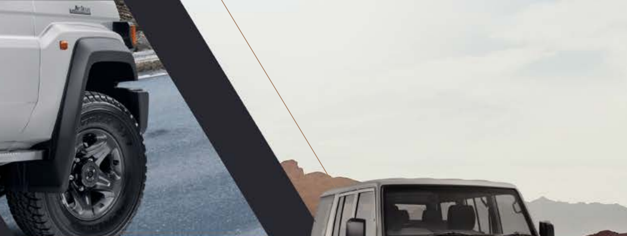
16" aluminium wheels