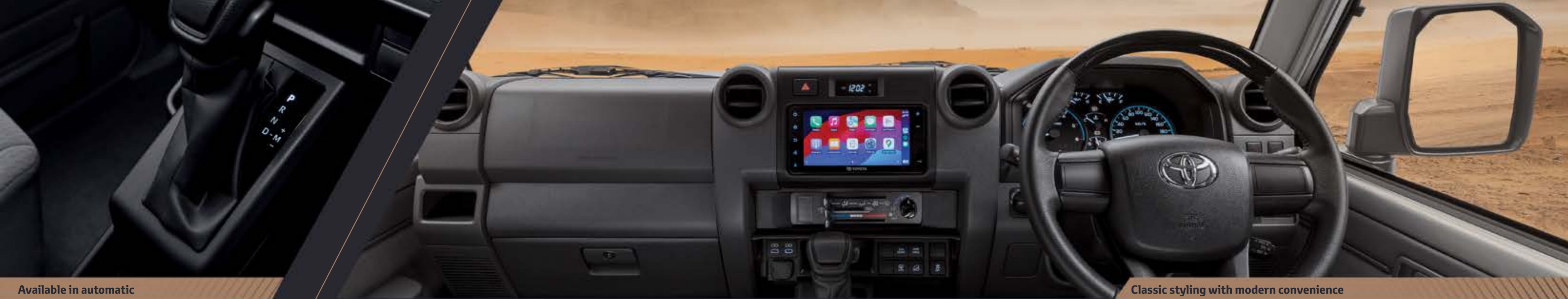
Available in automatic