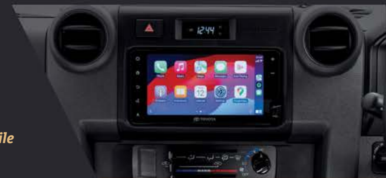
Touch-screen infotainment system

The Land Cruiser 70 Series' interior maintains its classic style while adding convenience to match the modern world.