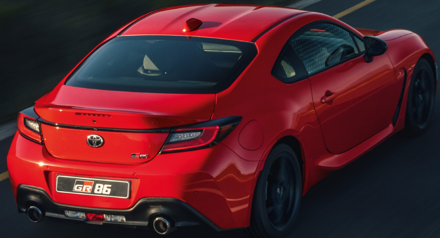
MODEL SHOWN: GR86 AT