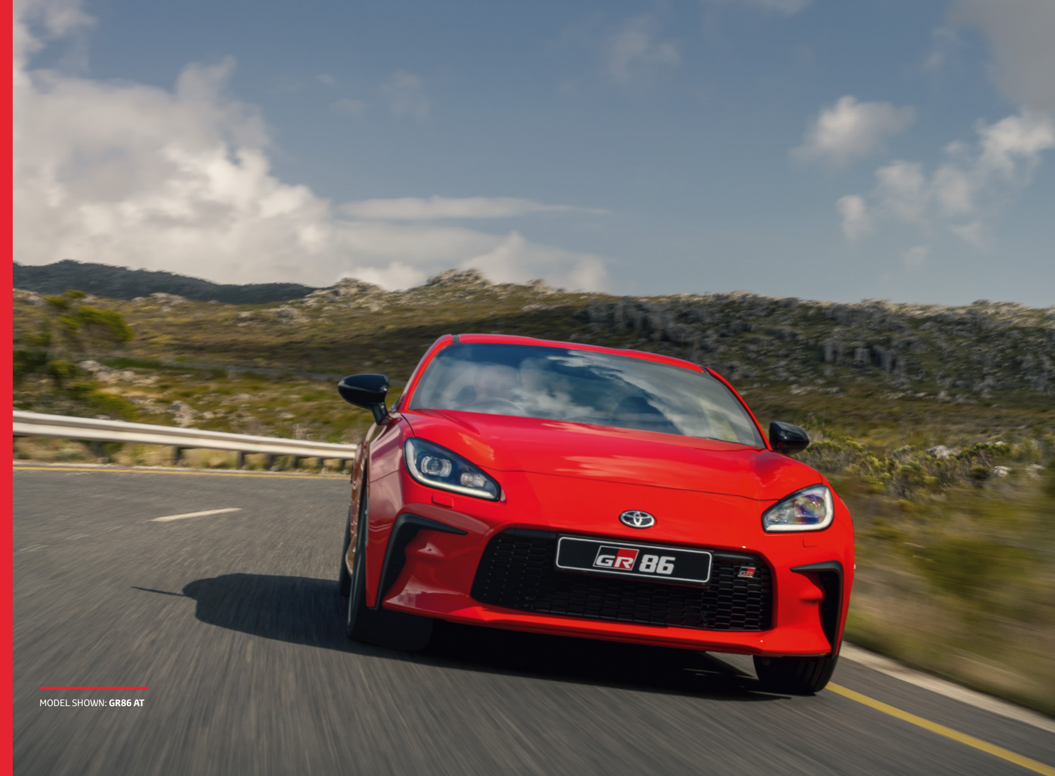
MODEL SHOWN: GR86 AT