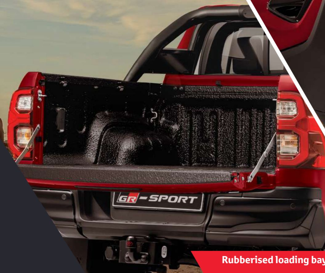
Rubberised loading bay