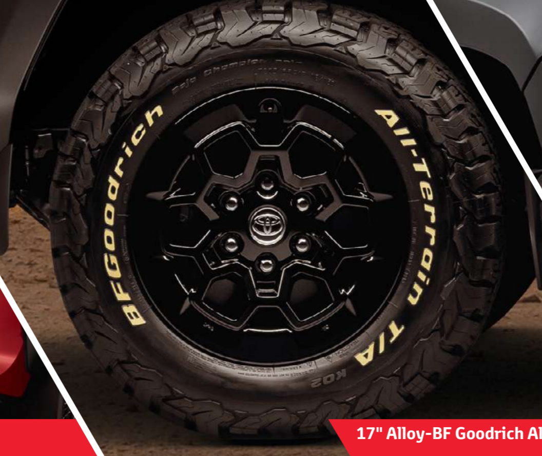
17" Alloy-BF Goodrich All-Terrain Tyres