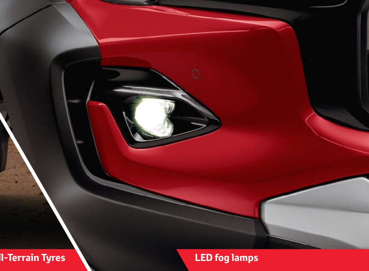
LED fog lamps